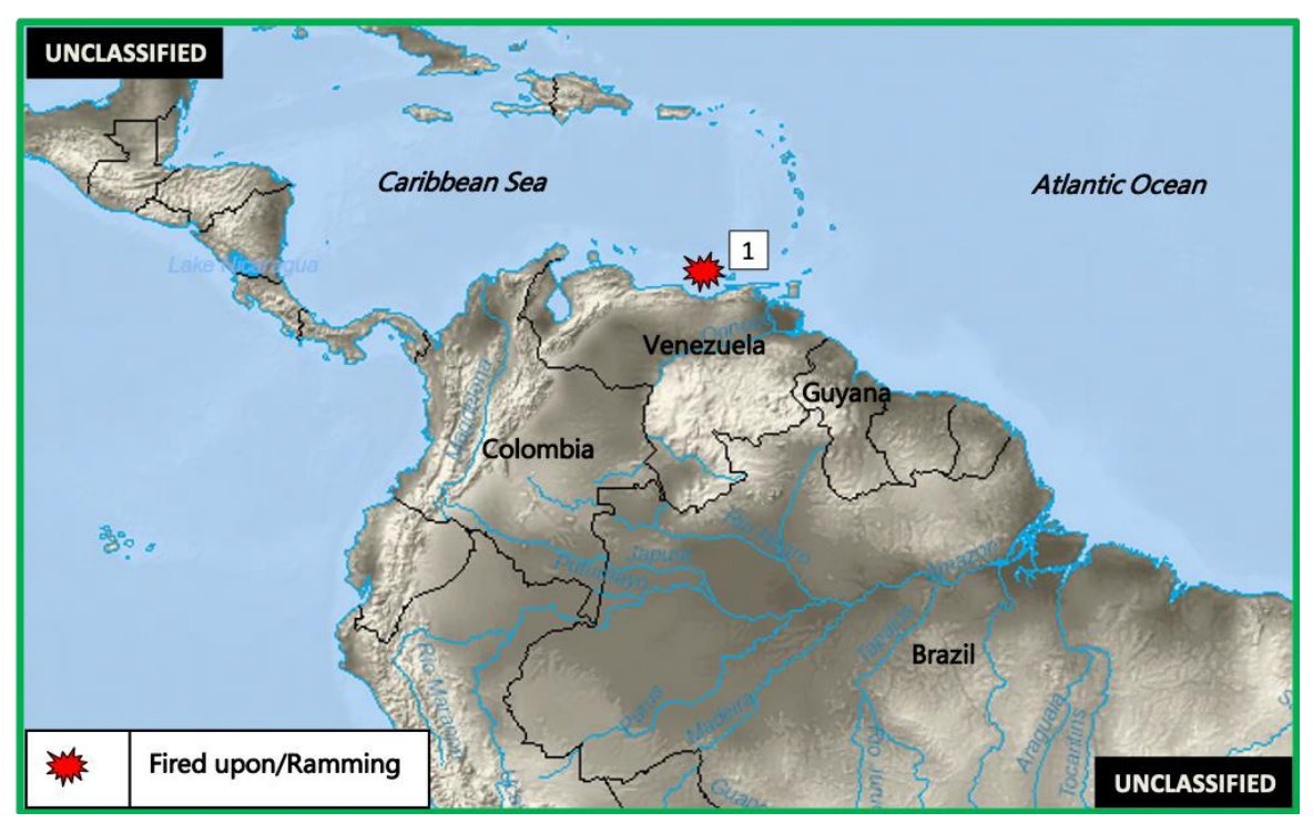
Figure 2. South America Piracy and Maritime Crime

(U) VENEZUELA: On 20 March shortly after midnight, the Venezuela Coast Guard patrol ship NAIGUATÁ approached and contacted the Portugal-flagged cruise ship RCGS RESOLUTE via radio questioning its intentions. At the time, RCGS RESOLUTE was in international waters off Venezuela's La Tortuga Island conducting routine engine maintenance prior to its arrival at Willemstad, Curaçao. NAIGUATÁ instructed RESOLUTE to follow it to Puerto Moreno on Isla De Margarita, a Venezuelan port. While the master was in contact with the head office, gun shots were fired and, shortly thereafter, NAIGUATÁ approached at speed the cruise ship's starboard side with an angle of 135 degrees, and purposely collided with the ice strengthened (steel reinforced) hull. The coast guard ship continued to ram the starboard bow in an apparent attempt to turn RESOLUTE's heading toward Venezuelan territorial waters. NAIGUATÁ subsequently began to take on water and sank. The cruise ship informed the international Maritime Rescue Coordination Centre (MRCC) of the incident and offered to assist. After one hour, RCGS RESOLUTE was informed by MRCC that assistance was not required as NAIGUATÁ's 32-crew members had been rescued by the Venezuelan Navy. RCGS RESOLUTE reportedly sustained only minor damage during the incident. (gCaptain, Columbia Cruise Services)