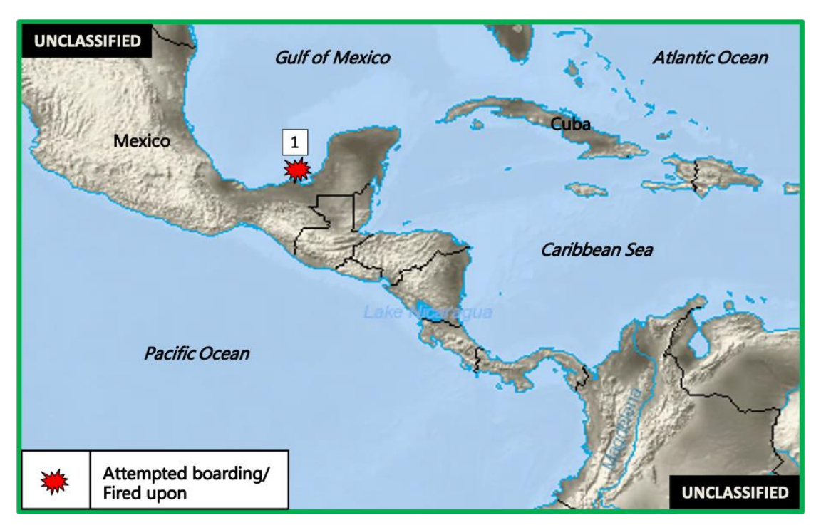
Figure 1. North America Piracy and Maritime Crime

1. (U) MEXICO: On 4 April, eight armed individuals in a boat approached a pipe laying vessel at high speed 13 NM northwest of Puerto de Dos Bocas, State of Tabasco in position 18:37N - 093:19W. The crew sounded the alarm, locked down the accommodation area, and mustered. As the boat approached the stern of the pipe laying vessel, the armed men fired at the vessel. The master was able to use the vessel's thrusters to prevent the boat from coming alongside. The armed persons subsequently abandoned their approach and departed the area. The crew notified port control via VHF radio of the incident and a patrol boat was dispatched to the location. (IMB, Clearwater Dynamics)