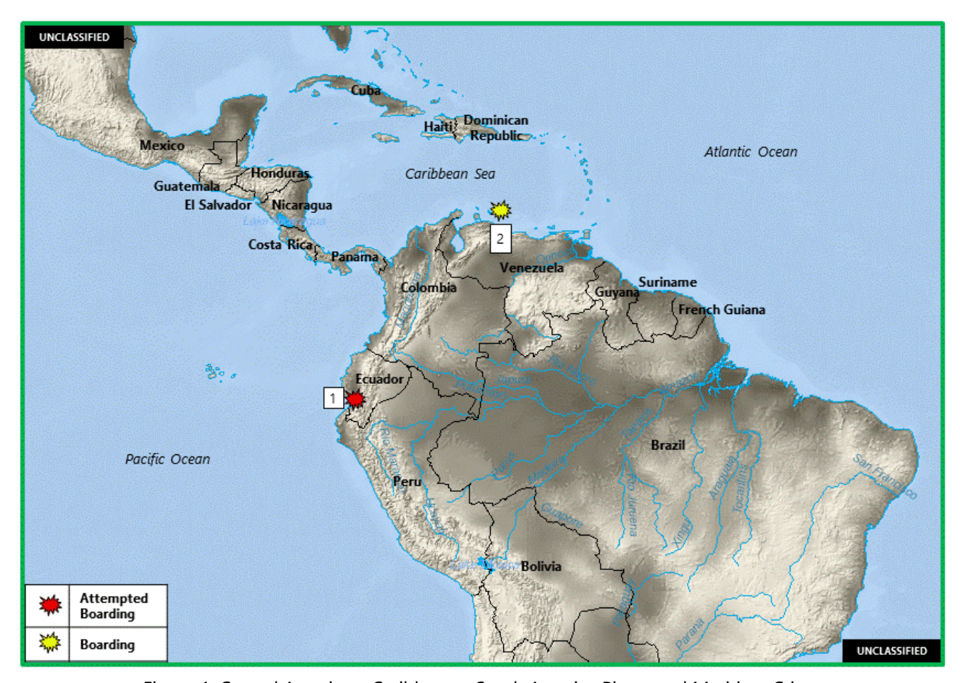
Figure 1. Central America – Caribbean – South America Piracy and Maritime Crime