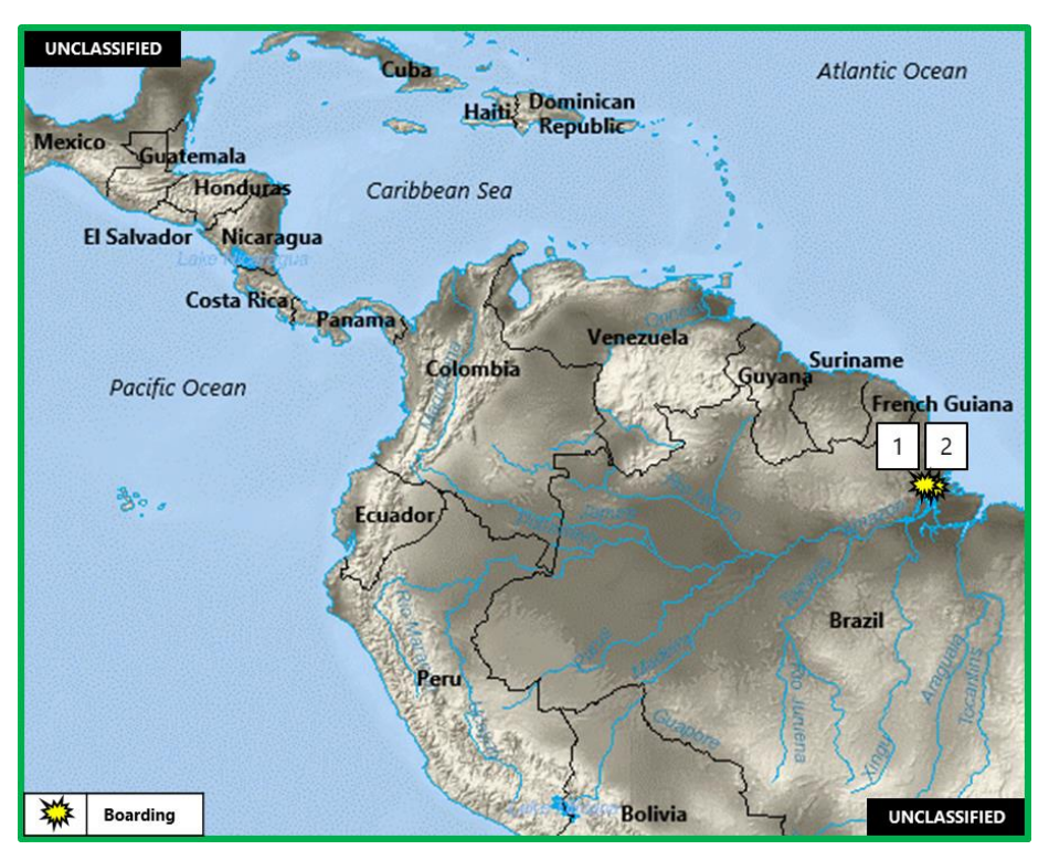
Figure 1. Central America – Caribbean – South America Piracy and Maritime Crime

1. (U) BRAZIL: On 25 January, at 1945 local time, crew members on the anchored Singapore-flagged bulk carrier KT BIRDIE foiled an attempted boarding at Macapa Anchorage, near position 00:00N – 050:59W. Two small boats were seen approaching the vessel, after which three robbers wearing black diving suits attempted to board from different positions. The master raised the alarm and mustered the crew. The crew used anti-piracy hoses to repulse the perpetrators, and, at 2000 local time, the crew observed the three perpetrators fleeing in one of the two boats spotted earlier. (ReCAAP; IMB; vesseltracker.com; Clearwater Dynamics)