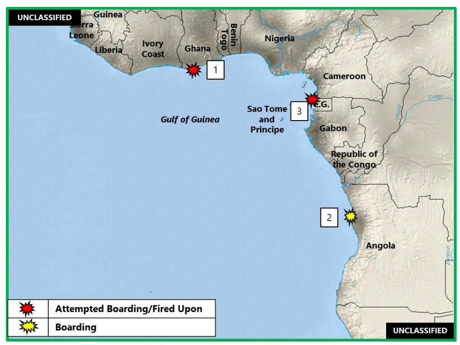
Figure 2. West Africa – Gulf of Guinea Piracy and Maritime Crime