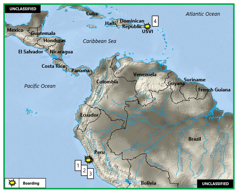
Figure 1. Central America – Caribbean – South America Piracy and Maritime Crime