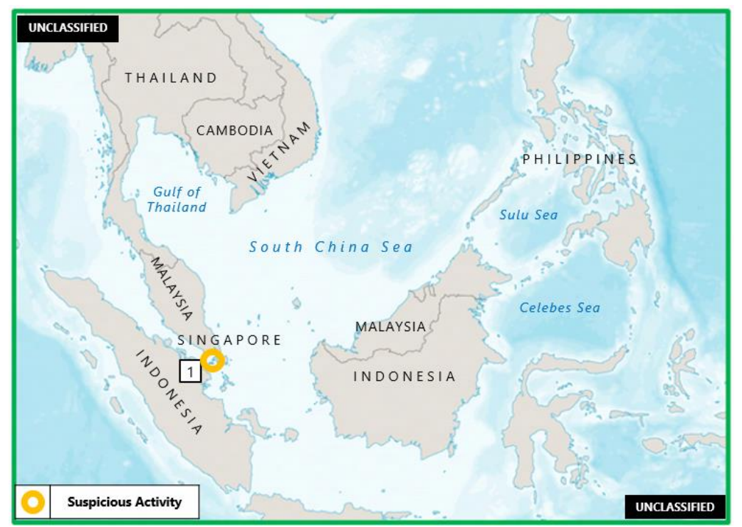
Figure 2. East Asia – Southeast Asia Piracy and Maritime Crime

1. (U) INDONESIA: On 30 May, the Panama-flagged tanker NORD JOY, was detained by the Indonesian Navy off Batam Island on suspicion of anchoring in Indonesian waters without a permit. According to press reports, the Indonesian Navy personnel boarded the vessel while anchored in Indonesian waters, east of the Singapore Strait. The vessel was then escorted by the Indonesian Navy to an anchorage near Batam for further investigation. (vesseltracker.com; Reuters; Jakarta Post; Asia Financial)