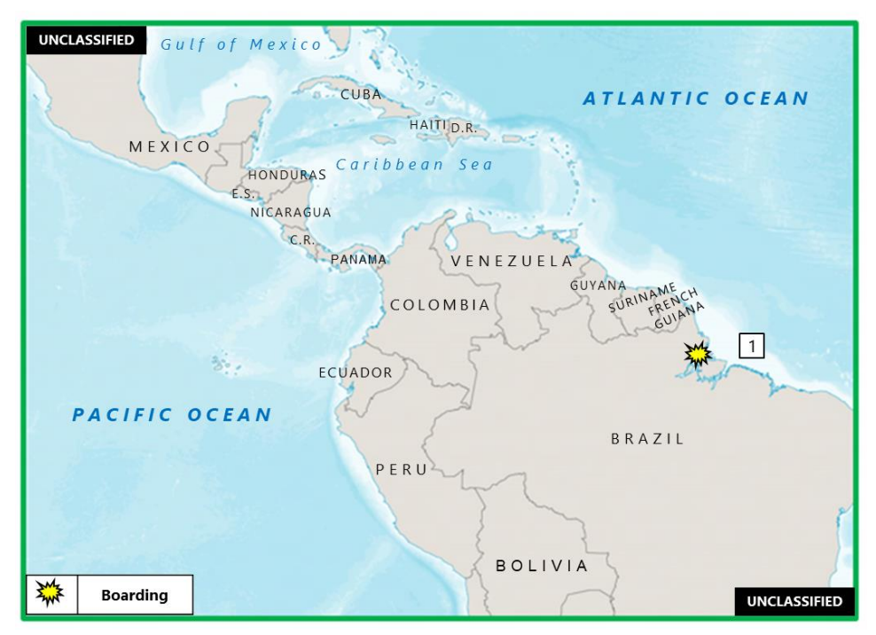
(U) Figure 1. Central America – Caribbean – South America Piracy and Armed Robbery at Sea