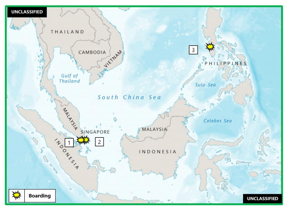
(U) Figure 3. East Asia – Southeast Asia Piracy and Armed Robbery at Sea