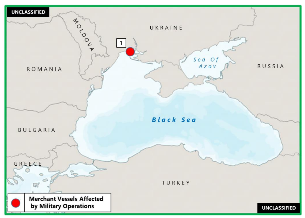
(U) Figure 1. Mediterranean – Black Sea Piracy and Armed Robbery at Sea

1. (U) UKRAINE: On 31 October, shelling hit two tugboats involved in the transportation of grain barges at the port of Ochakiv, near position 46:36N – 031:33E. According to reporting from the Ukrainian Operational Command South, fire broke out onboard the vessels after they were hit. Two crew members were reported killed, another was injured, and one is missing. There is no indication of whether the strikes specifically targeted the tugboats or resulted from indiscriminate shelling of the port area. (Maritime Executive; Clearwater Dynamics)