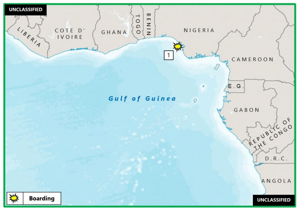
(U) Figure 2. West Africa – Gulf of Guinea Piracy and Armed Robbery at Sea

1. (U) NIGERIA: On 28 October at an unspecified time, robbers armed with machetes boarded an underway offshore supply vessel (OSV) approximately 12 NM west of Escravos, near position 05:30N – 004:57E. After boarding, the perpetrators attacked the captain and two additional crew members, stole valuables from the vessel, and forced the crew to transfer approximately 3200 USD via their phones. The robbers escaped following the approach of a security vessel coming to assist the OSV. The captain and two crew members attacked by the robbers were transferred to a hospital and are reported to be in critical condition. (Clearwater Dynamics)