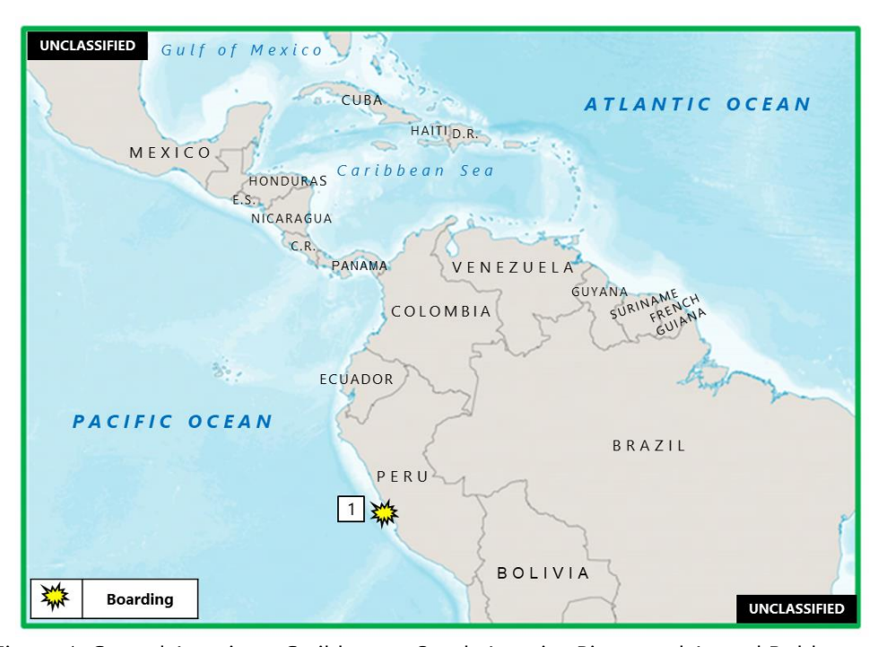
(U) Figure 1. Central America – Caribbean – South America Piracy and Armed Robbery at Sea

1. (U) PERU: On 7 November at 0500 local time, an unknown number of robbers boarded Bahamas-flagged crude oil tanker TAHOE SPIRIT anchored in Callao Anchorage, near position 12:00S – 077:13W. The robbers stole ship's stores and escaped unnoticed. On routine rounds, duty crew discovered the robbery when they noticed that the hawse pipe cover had been moved, the forepeak store had been broken into, and ship's stores were missing. The incident was reported to the Callao Vessel Traffic Service. (IMB; Clearwater Dynamics; vesseltracker.com)