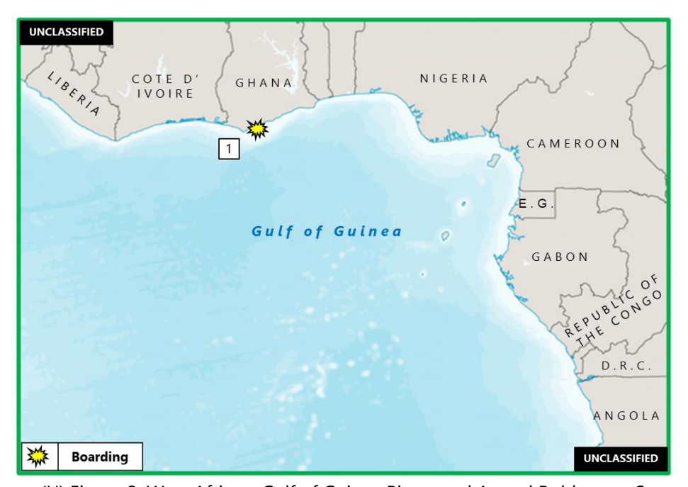
(U) Figure 2. West Africa – Gulf of Guinea Piracy and Armed Robbery at Sea

1. (U) GHANA: On 16 November at 0150 local time, three robbers armed with knives boarded a bulk carrier anchored in Takoradi Anchorage, near position 04:53N – 001:40W. Duty crew spotted the robbers onboard the vessel, informed the bridge, and raised the alarm. Prior to making their escape, the robbers threatened the duty crew. The incident was reported to port authorities and port security boarded the vessel to investigate. The paint locker was found to be broken into and items of ship's stores were missing. (IMB; Clearwater Dynamics)