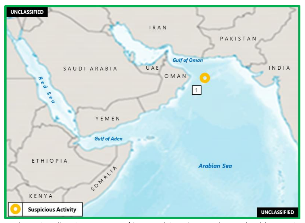
(U) Figure 3. Indian Ocean – East Africa – Red Sea Piracy and Armed Robbery at Sea

1. (U) OMAN: On 15 November at 1536 UTC, the Liberia-flagged product tanker PACIFIC ZIRCON sustained minor damage to its hull approximately 150 NM off the coast of Oman, near positon 22:08N – 062:36E. Press reports indicate that a drone strike was suspected to have been the cause of the damage to the ship. The ship's owner reported that all crew are safe and accounted for, and that the hull damage did not result in spillage of cargo or water ingress. (Clearwater Dynamics; UKMTO; Reuters; Maritime Executive; Dryad Global)