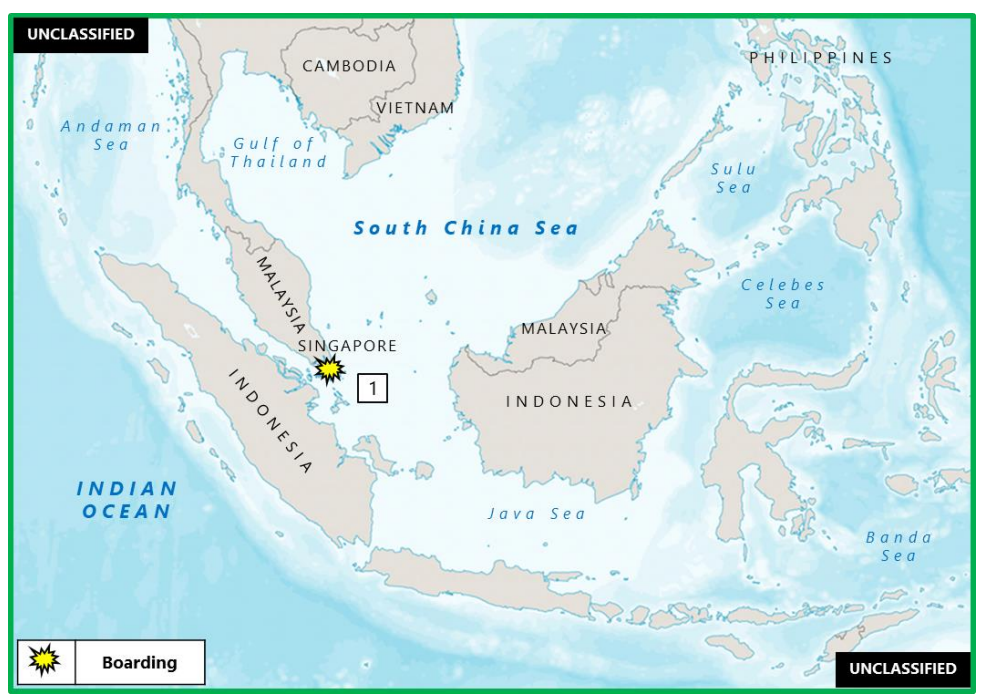
Figure 1. (U) East Asia – Southeast Asia Piracy and Armed Robbery at Sea