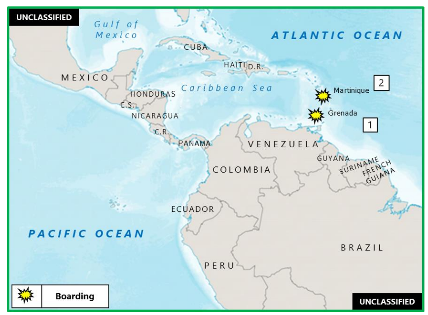
Figure 1. (U) Central America – Caribbean – South America Piracy and Armed Robbery at Sea

1. (U) GRENADA: On 16/17 January between 2230 and 0130 local time, perpetrators stole an unsecured dinghy with a 15HP Yamaha outboard engine from a yacht anchored in Tyrrel Bay near the approximate position 12:27N – 061:29W. An incident report was made on the VHF net and to the local coast guard. (Caribbean Safety and Security Net)