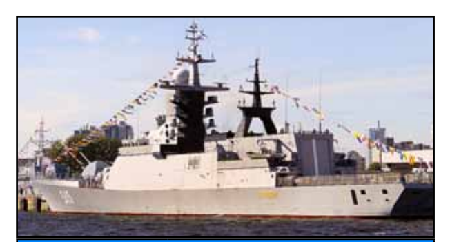
STEREGUSHCHIY Class basic characteristics:

The Design 20380 STEREGUSHCHIY Class was designed by the Almaz Central Naval Design Bureau in St. Petersburg and is being built by the (Severnaya Verf) Northern Shipyard in the same city. Construction of additional units is also underway in the