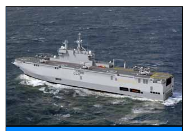
MISTRAL Class basic characteristics:

The first ship, Vladivostok , was to be delivered to Russia by the end of 2014 to complete outfitting before being assigned to operational forces. The second, Sevastopol , had initial sea trials planned for 2015. Both units were expected to be operational in late 2015 and were to be based in Vladivostok as part of the Pacific Fleet.