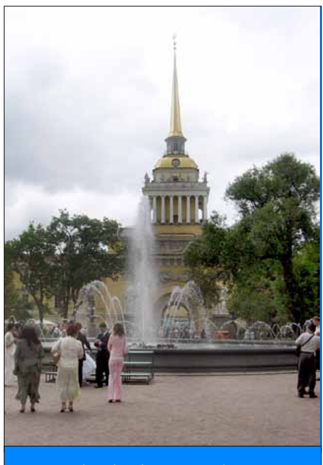
The Admiralty in St. Petersburg

The 19th century saw the Russian Navy transition from the "Age of Sail" to the "Age