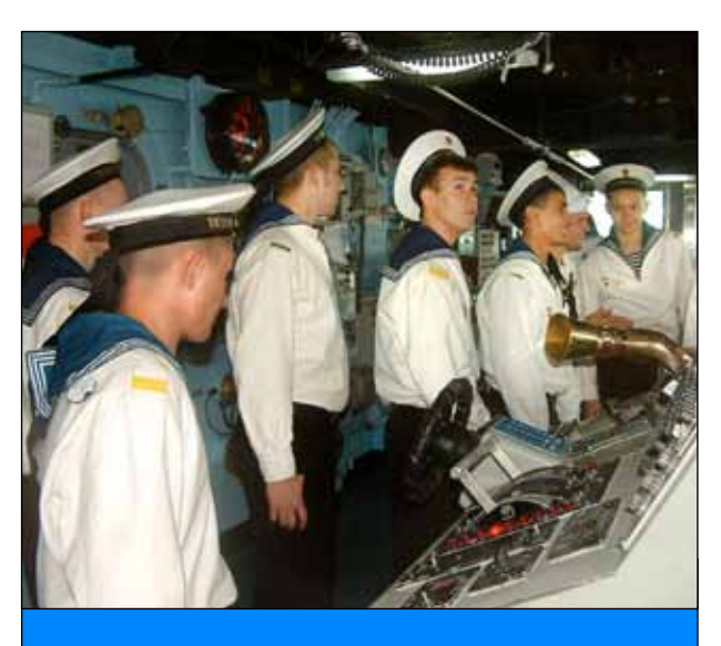
Russian sailors on the bridge of USS Fort McHenry (LSD 43)

Service schools are the predominant path to service as an officer and a young man aspiring to a naval career normally chooses to attend one of five naval commissioning schools, usually the one near his home. The curricula of these schools reflect the political, ethical, and moral expectations Russia sets for future officers through a rigid set of training requirements. The exception to a near home choice would be choosing to attend the St. Petersburg Naval Institute Peter the Great Corps (established in 1701), the premier school of the naval service, with an eye on a future high leadership position. Once commissioned, he will be assigned to serve in a unit located within the immediate or adjacent geographic region. Once settled in, he has the potential to progress in rank through Captain 1st Rank (O-6 equivalent) within the same overall military unit, possibly on the same ship. Promotions in rank through Captain 3rd Rank (O-4) are dominantly within the purview of the immediate commanding officer. Promotion to higher ranks involves decisions by formation and fleet commanders. Flag ranks are the combined purview of the Navy Command and the Ministry of Defense.