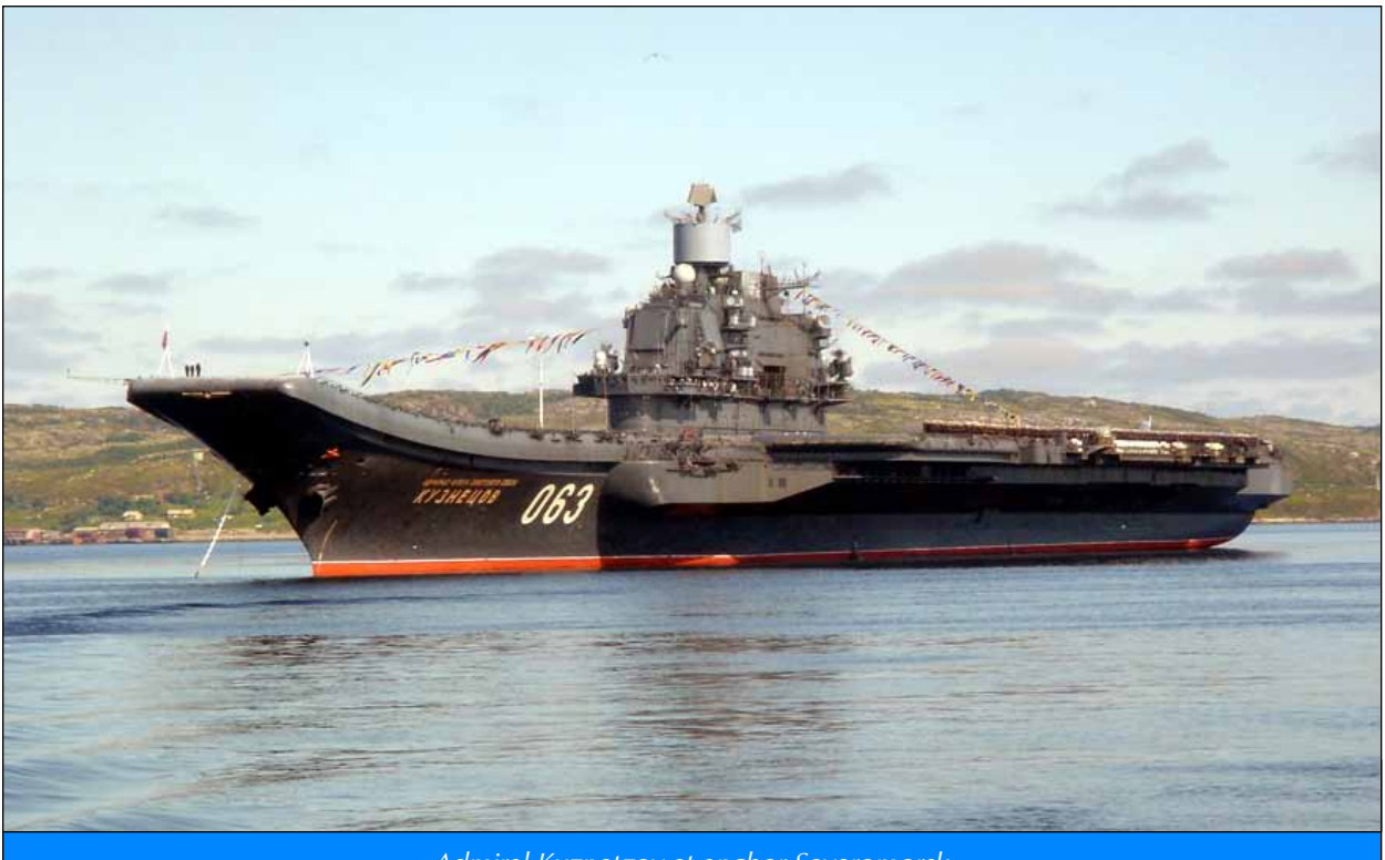
Admiral Kuznetzov at anchor Severomorsk

organizational disarray and financial neglect as the Russian leadership focused on the priorities of national transformation from the framework of the totalitarian and socialist Soviet state into a fledgling democracy embracing a market economy. During this "time of troubles," most naval programs were either suspended or halted altogether. Only efforts to improve command and control systems and lessexpensive new design work continued to be pursued.