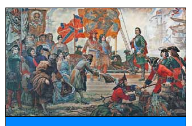
Painting depicting Peter the Great as a naval leader

Russian seafaring goes back to Kievan Rus' in the 9th century when medieval commerce was active along the north-south riverine trade route "from the Varangians (Vikings) to the Greeks" connecting the Baltic and the Black Seas. In the south, direct access to the Black Sea carried trade to Constantinople (Istanbul). From the 12th century on, coastal residents of the north voyaged to Novaya Zemlya and to what is today called Spitsbergen. The Mongol invasions of the 12th century displaced Kievan Rus' and unrestricted commercial access to the Black Sea was lost. As the Rus' battled the Mongols, tenuous access to the Baltic was lost