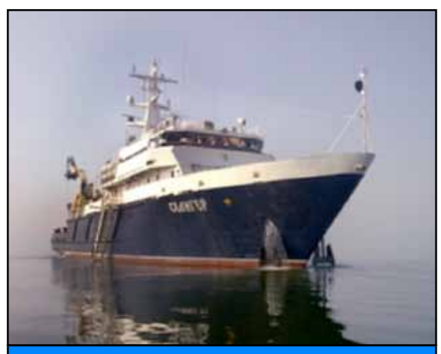
SELIGER Class basic characteristics:

Oceanographic Research Vessel ( built, series intended ) Design 22010 was also designed by the Almaz Design Bureau, St. Petersburg. The