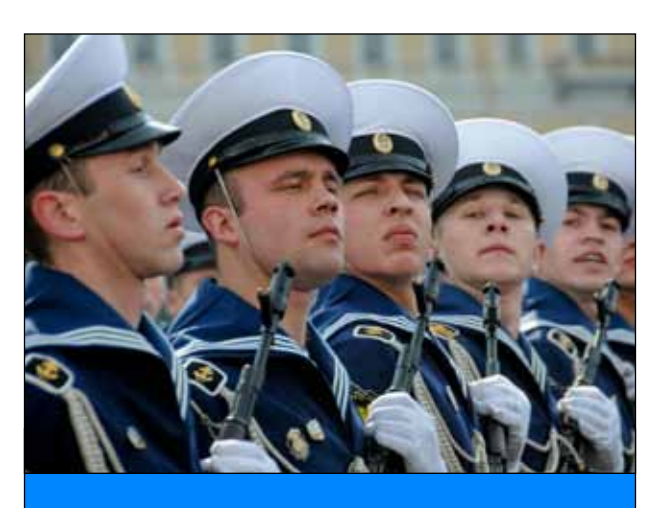
Russian Naval Midshipmen in parade formation

In doing the above, the Russian Armed Forces must be able to: