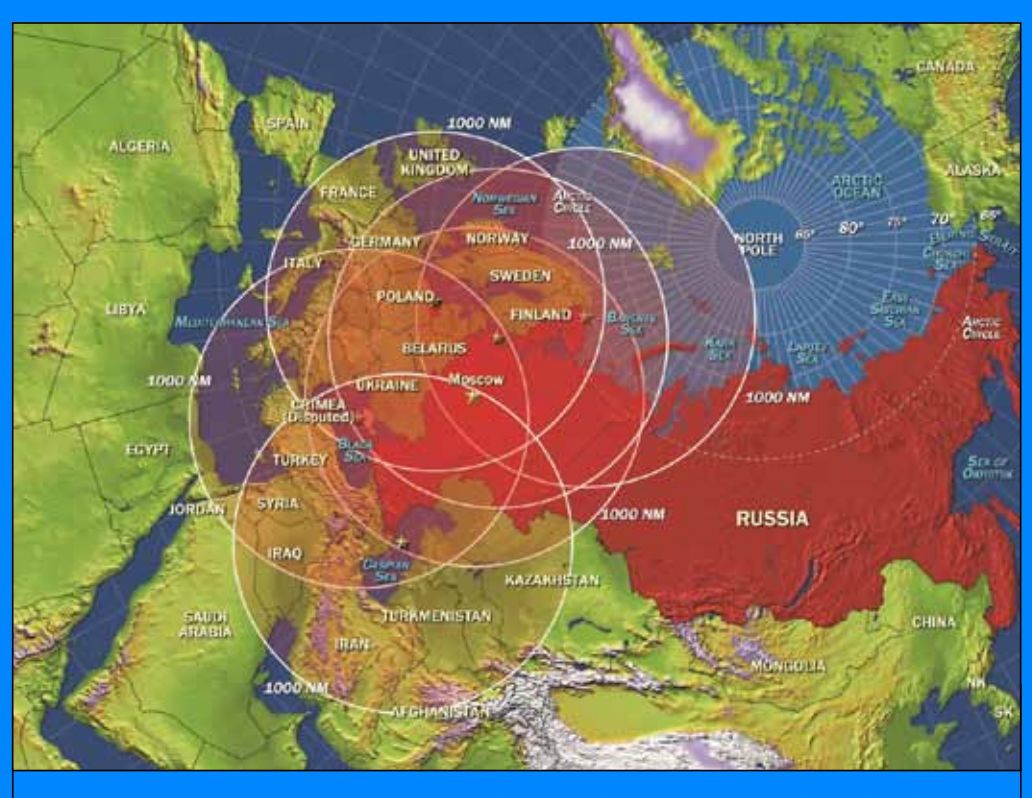
1000nm range rings – Perceived TLAM threat to Russian homeland

Layered Defense. Having acquired the means to strike targets at long ranges using ballistic missiles launched from nuclearpowered submarines, it was now possible to directly protect them and the country against attacks from the sea. To accomplish this, the Navy developed a layered defense strategy. Today, the outer limit of this layered defense can be generally defined as about 1,000 nautical miles (TOMAHAWK land attack cruise missile range) from the Russian frontier or from Moscow. For western Russia, this outer