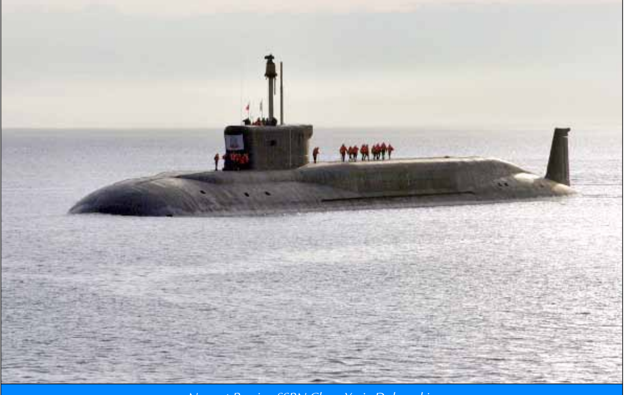
Newest Russian SSBN Class: Yuriy Dolgorukiy

The new submarine and ship classes will incorporate the latest advances in militarily significant areas such as: weapons; sensors; command, control and communication capabilities; signature reduction; electronic countermeasures; and automation and habitability. More technologically advanced total ship systems requiring smaller crews will be complemented with personnel better trained and educated to exploit the full potential of their combat systems.