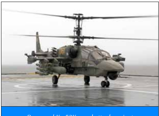
Proposed Ka-52K naval attack variant

The development of extended and interlinked intelligence, surveillance, and reconnaissance systems within the "World Ocean" Federal Targeted Program initiated in 1997 was intended to make Russian naval and other military and civilian systems more integrated and interoperable, and, if successful, was planned to support better informed and timely direction of the Navy by commanders both afloat and ashore.