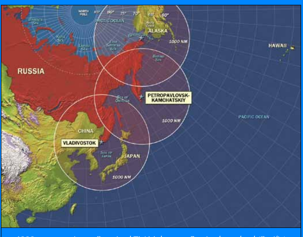
1000nm range rings – Perceived TLAM threat to Russian homeland (Pacific)

bound runs through the Greenland-Iceland-United Kingdom gap separating the North Atlantic from the Norwegian Sea. In the Mediterranean, the line runs roughly northsouth at the boot of Italy defining the eastern and western Mediterranean. In the Pacific, there are no easily identifiable geographic bounds at the 1,000 nm range (distances from three points provide general orientation). The disintegration of the USSR did more to change Russia's strategic defense depth on land (a loss of about 300 miles) but had negligible effect on seaward concerns.