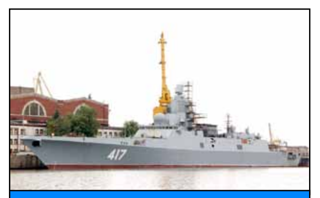
GORSHKOV Class basic characteristics: