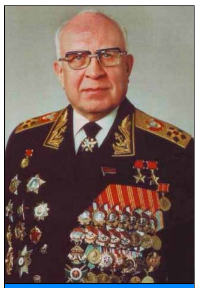
Fleet Admiral of the Soviet Union S.G. Gorshkov

close encounters at sea more safe and less hazardous—the 1972 Agreement for the Prevention of Incidents On and Over the High Seas (INCSEA)—which continues to function today.