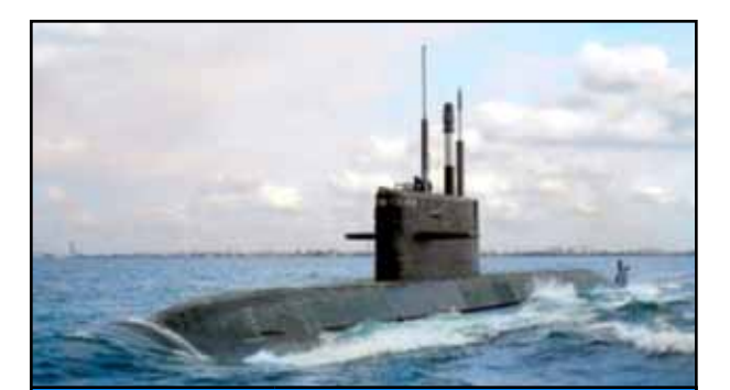
PETERSBURG Class Basic Characteristics: