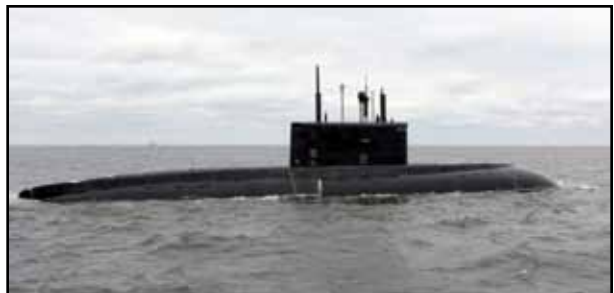
KILO Class Basic Characteristics:

The PETERSBURG SS, also known as Lada and Design 677, is a diesel-electric submarine intended to be a technological advance on the KILO Design 636, specifically with regard to propulsion, sonar, and combat information support. The class is the product of the Rubin Central Marine Equipment Design Bureau and was built by the Admiralty Shipyard, both are in St. Petersburg. The lead hull Sankt Peterburg, laid down in 1997 and commissioned in 2010 for trial operation, is now located in the Northern Fleet. During initial trials problems were encountered with the electric propulsion system, the main sonar, and combat information system. It has been reported that these issues have been resolved and work has restarted on hull two Kronshtadt, laid down