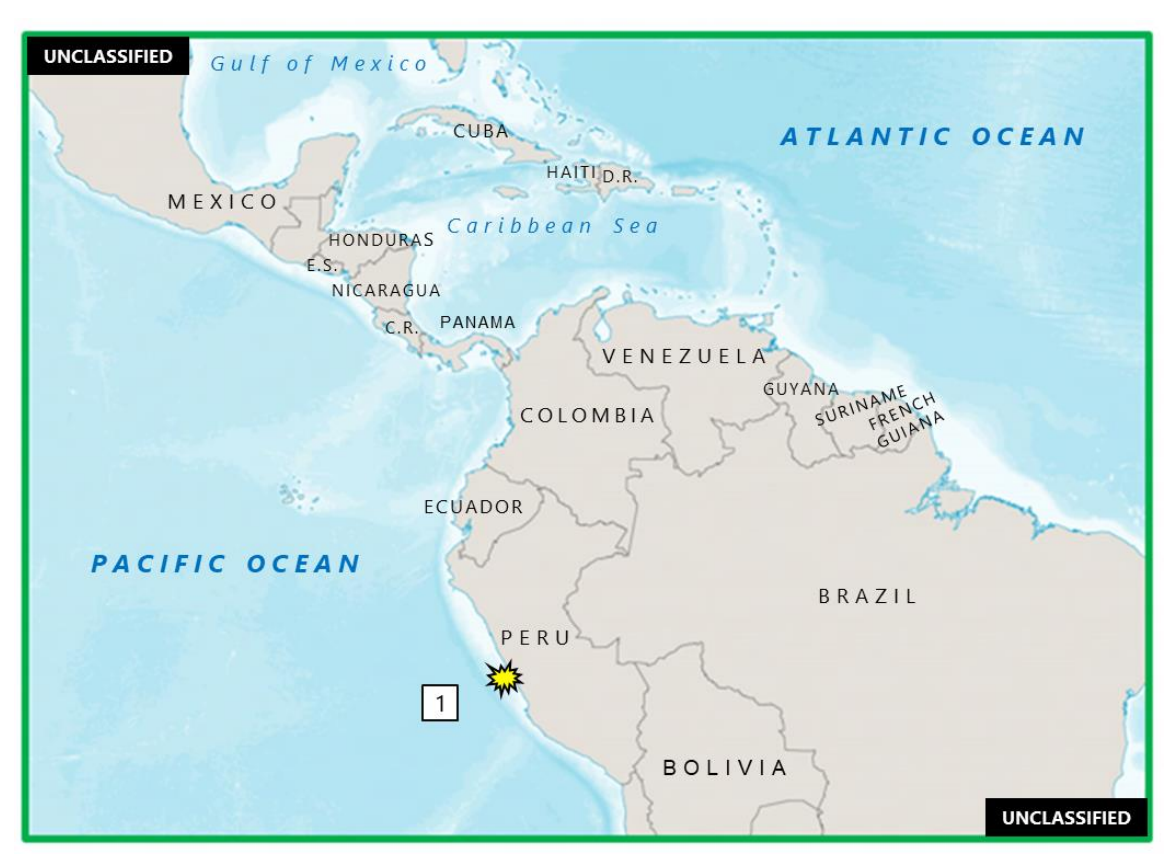
(U) Figure 1. Central America – Caribbean – South America Piracy and Armed Robbery at Sea