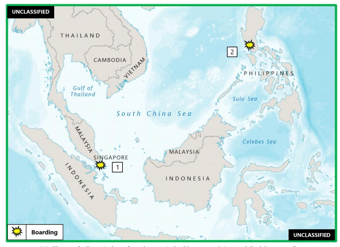
(U) Figure 3. East Asia – Southeast Asia Piracy and Armed Robbery at Sea