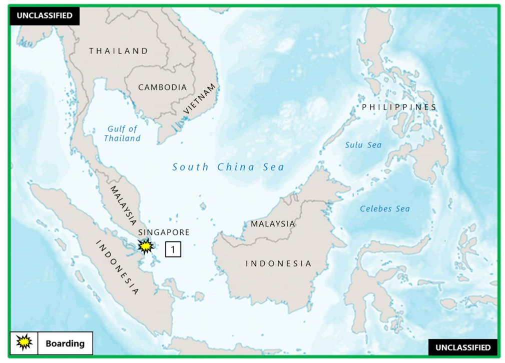
(U) Figure 1. East Asia – Southeast Asia Piracy and Armed Robbery at Sea

1. (U) INDONESIA: On 22 May at 0230 local time, up to five robbers boarded the Singapore-flagged bulk carrier LUCKY SOURCE underway in the eastbound lane of the Singapore Strait Traffic Separation Scheme (TSS), near position 01:02N – 103:39E. The duty officer spotted the perpetrators (one holding a knife) in the engine room and alerted the bridge. The master raised the alarm to notify the crew. Upon hearing the alarm, the robbers fled the vessel and escaped. The ship reported engine spare parts and crew's personal belongings had been stolen, but no injuries with all crew accounted for. The vessel did not require assistance and continued its voyage to Singapore. (IMB; Clearwater Dynamics; vesseltracker.com; ReCAAP)