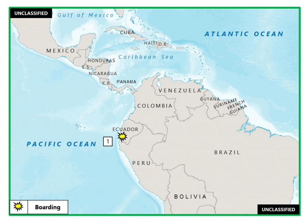
(U) Figure 1. Central America – Caribbean – South America Piracy and Armed Robbery

1. (U) ECUADOR: On 10 June at 0215 UTC, robbers in speedboats came alongside the underway Germany-flagged container ship CALLAO EXPRESS approximately 17 NM off the coast and 53 NM west-southwest of Guayaquil, near position 02:54S – 080:33W. The robbers attempted to board using ladders. The alarm was raised, deck lights illuminated, crew mustered, and the master conducted evasive maneuvers. The master informed the Ecuadorian