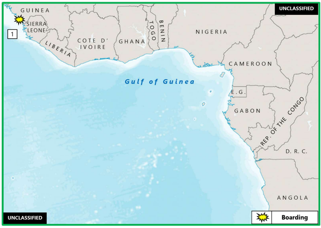
(U) Figure 1. West Africa – Gulf of Guinea Piracy and Armed Robbery at Sea