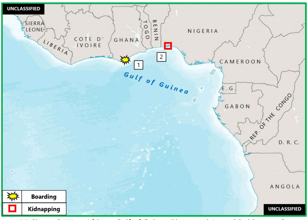
(U) Figure 2. West Africa – Gulf of Guinea Piracy and Armed Robbery at Sea

1. (U) GHANA: On 28 June at 0055 local time, three robbers boarded an anchored cargo ship at Takoradi Anchorage, near position 04:53N – 001:38W. The robbers were seen lowering paint buckets down the side of the