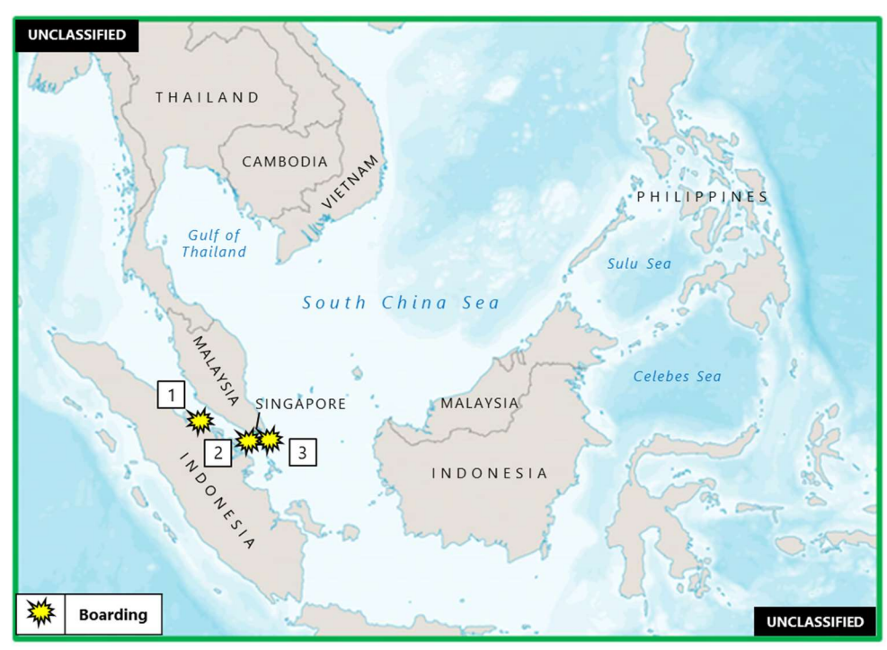
(U) Figure 4. East Asia – Southeast Asia Piracy and Armed Robbery at Sea