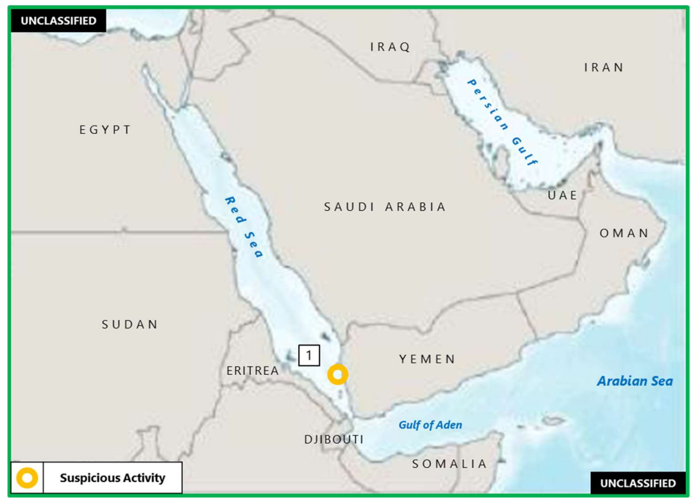
(U) Figure 3. Indian Ocean – East Africa – Red Sea Piracy and Armed Robbery at Sea

1. (U) YEMEN: On 27 June at 0921 local time, two skiffs with up to six persons armed with guns onboard each skiff approached to within 50 meters on the port side of an underway tanker approximately 20 NM west of Al Hudaydah, near position 14:46N – 042:34E. No shots were fired. The vessel increased speed and commenced evasive maneuvers, resulting in the skiffs departing the area. The tanker and crew are safe. (UKMTO; Clearwater Dynamics; IMB)