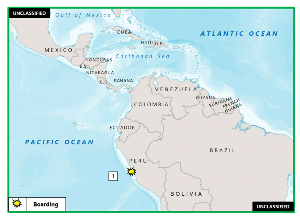
(U) Figure 1. Central America – Caribbean – South America Piracy and Armed Robbery at Sea

1. (U) PERU: On 21 June at 0001 local time, robbers boarded the anchored Liberia-flagged bulk carrier CAIPIRINHA at Callao Anchorage, near position 12:02S – 077:11W. Robbers stole ship's stores before escaping unnoticed. The duty crew discovered the theft during routine rounds and the ship reported the incident to the local agent. (IMB; Clearwater Dynamics; vesseltracker.com)