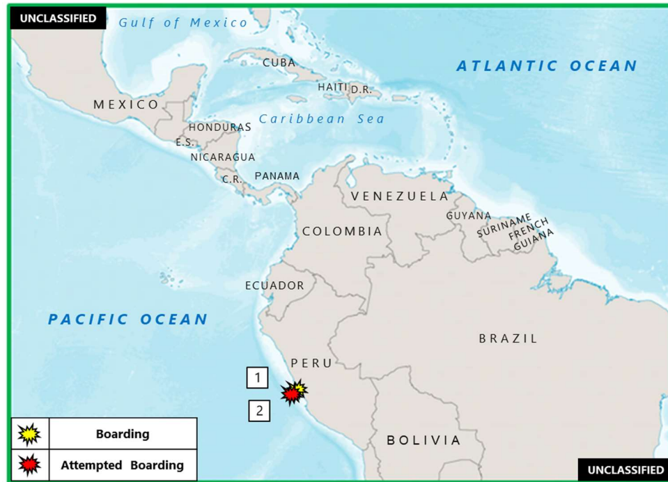
(U) Figure 1. Central America – Caribbean – South America Piracy and Armed Robbery at Sea

1. (U) PERU: On 24 July at 0330 local time, the duty crew on routine rounds onboard an anchored bulk carrier at Callao Anchorage, near position 12:01S – 077:12W, discovered a padlock broken and ship's stores stolen. The crew conducted a search but no unauthorized persons were found onboard. The vessel reported the incident to port control and a patrol boat was dispatched to the ship's location to search the area. (IMB; Clearwater Dynamics)