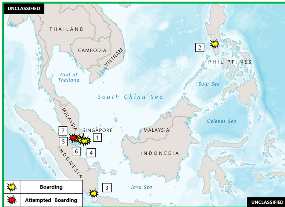
(U) Figure 3. East Asia – Southeast Asia Piracy and Armed Robbery at Sea

1. (U) MALAYSIA: On 23 July at 2220 local time, four robbers boarded a barge under tow by a tugboat in the westbound lane of the Singapore Strait Traffic Separation Scheme (TSS), near position 01:18N – 104:10E. A Malaysian Maritime patrol boat, dispatched to the location, apprehended four Indonesian males who were unloading scrap metal from the barge. (Clearwater Dynamics)