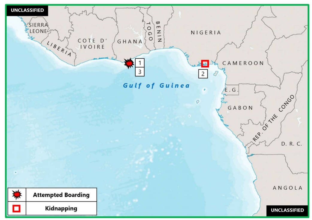
(U) Figure 1. West Africa – Gulf of Guinea Piracy and Armed Robbery at Sea