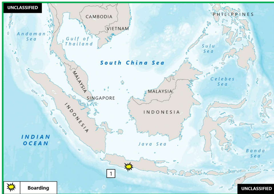
(U) Figure 1. East Asia – Southeast Asia Piracy and Armed Robbery at Sea

1. (U) (LATE REPORTING) INDONESIA: On 7 September (time not specified), six robbers boarded a berthed barge at Cilacap Port on the island of Java, near position 07:44S – 108:59E. Indonesian authorities apprehended one of the perpetrators and recovered two tons of coal stolen from the barge. (Clearwater Dynamics)