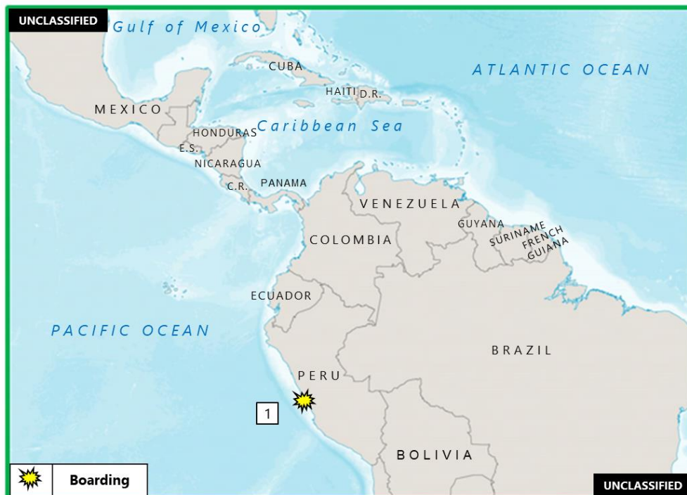
(U) Figure 1. Central America – Caribbean – South America Piracy and Armed Robbery at Sea

B. (U) CENTRAL AMERICA – CARIBBEAN – SOUTH AMERICA: