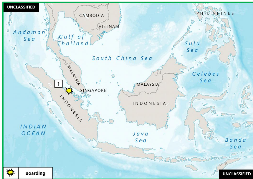
(U) Figure 4. East Asia – Southeast Asia Piracy and Armed Robbery at Sea

1. (U) (LATE REPORTING) INDONESIA: On 24 August at 0150 local time, three robbers boarded the Panama-flagged product tanker SHOTAN anchored in Dumai Inner Anchorage, near position 01:43N – 101:26E. The duty crew noticed the perpetrators armed with knives near the engine room. The robbers threatened the duty crew, who fled the vicinity and raised the alarm. Once the alarm was raised, the robbers fled the vessel with stolen engine spares. (IMB; vesseltracker.com)