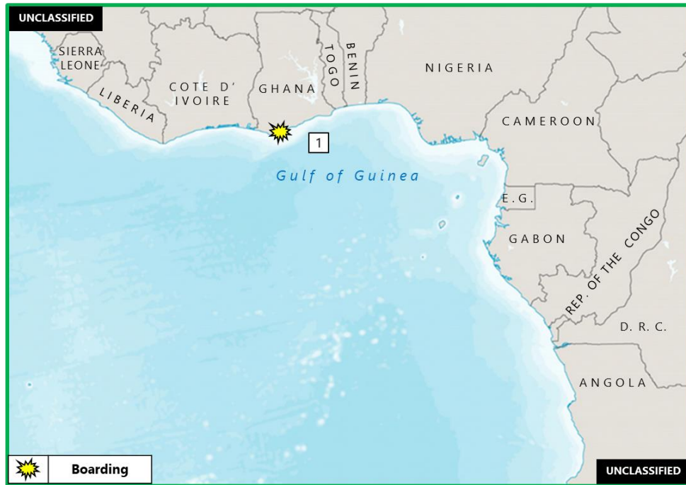
(U) Figure 3. West Africa – Gulf of Guinea Piracy and Armed Robbery at Sea

1. (U) EGYPT: On 29 September at 1945 local time, the chief officer onboard a bulk carrier berthed at Port Said, near position 31:10N – 032:20E, noticed two stevedores exiting from the helicopter store room. When the chief officer called out for the stevedores to stop, they ran away. One stevedore was apprehended with the assistance of a port safety officer. An investigation revealed that ship's stores and properties had been stolen. (IMB; Clearwater Dynamics)