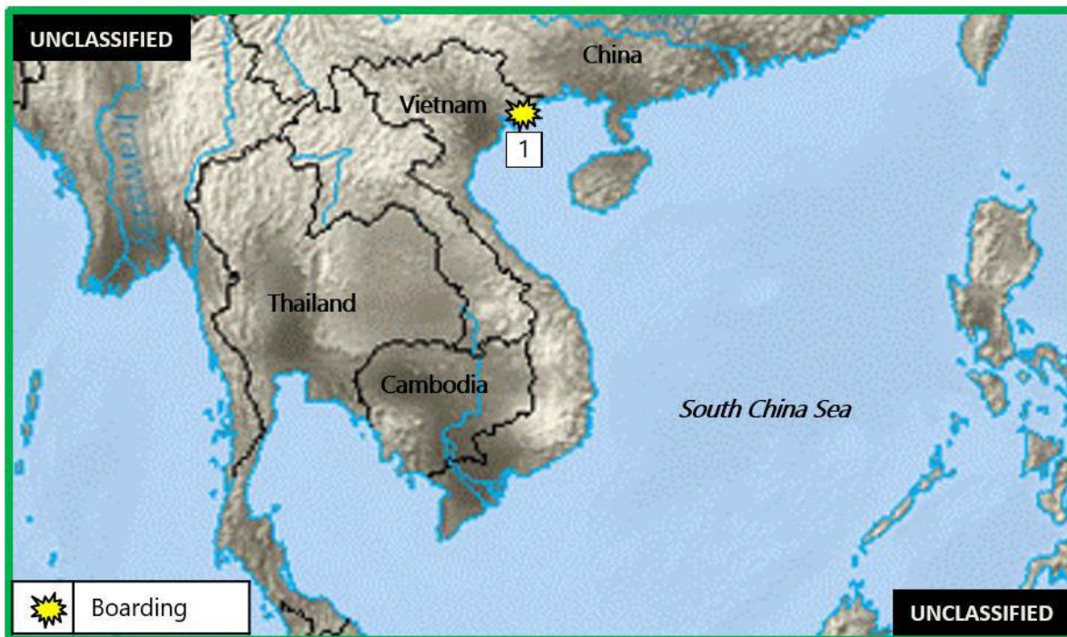
Figure 3. Southeast Asia Piracy and Maritime Crime

1. (U) VIETNAM: On 22 May at 0130LT, a crew member following a cargo operation discovered a theft had occurred on the anchored Liberia-flagged bulk carrier BALTIC COVE in the Campha Anchorage at 20:57N - 107:18E. The crew member discovered some hose nozzles in a drum near the paint store. A subsequent inspection revealed a hoisting wire was also missing from the bosun store. The incident was reported to the local agent. (ReCAAP, Clearwater Dynamics)