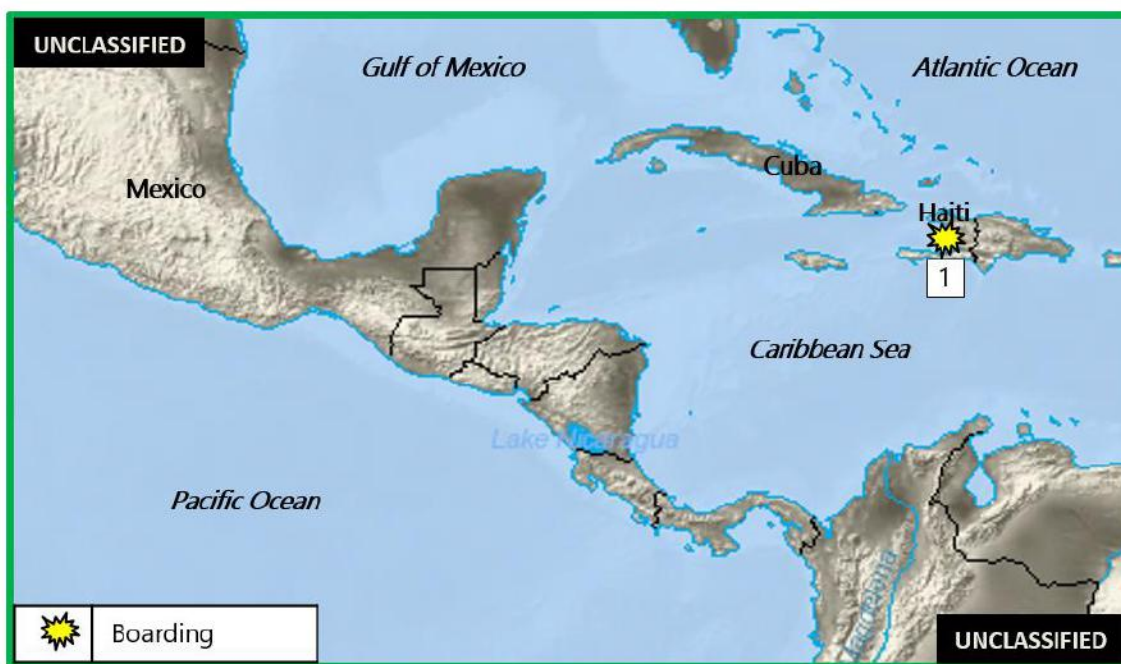
Figure 1. Caribbean Piracy and Maritime Crime