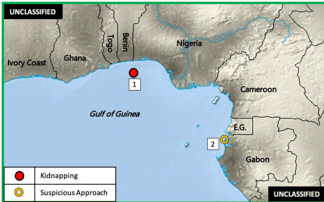
Figure 1. Gulf of Guinea Piracy and Maritime Crime

1. (U) BENIN: On 24 June at 1530LT, pirates on a speedboat boarded the Ghana-flagged fishing vessel PANOFI FRONTIER approximately 60 NM south of Cotonou in vicinity of 05:21N - 002:37E. The pirates kidnapped five South Koreans and one Ghanaian. (Clearwater Dynamics, Dryad Global, Maritime Security)