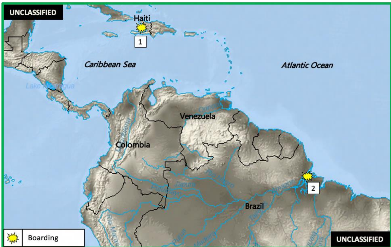
Figure 1. Caribbean and South American Piracy and Maritime Crime