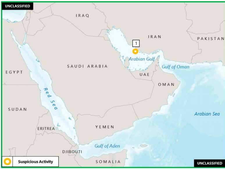
(U) Figure 2. Suspicious Activity in Arabian Gulf

1. (U) IRAN: On 29 August, several reports indicated that Global Positioning System (GPS) interference occurred offshore of Assaluyeh. (UKMTO; Clearwater Dynamics)