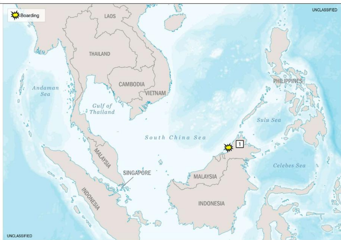
(U) Figure 1. Piracy and Attempted Robbery at Sea in Southeast Asia