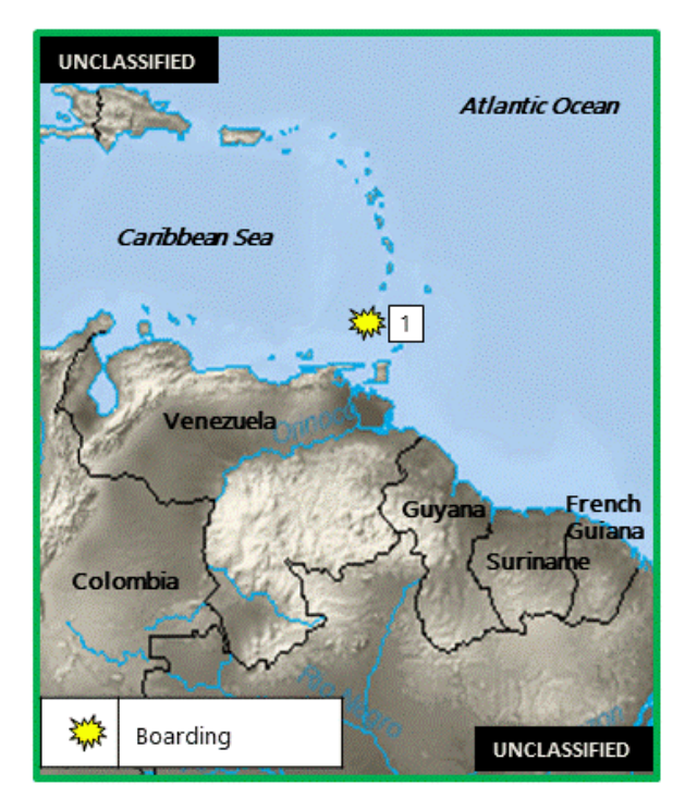
Figure 1. Central America – Caribbean – South America Piracy and Maritime Crime