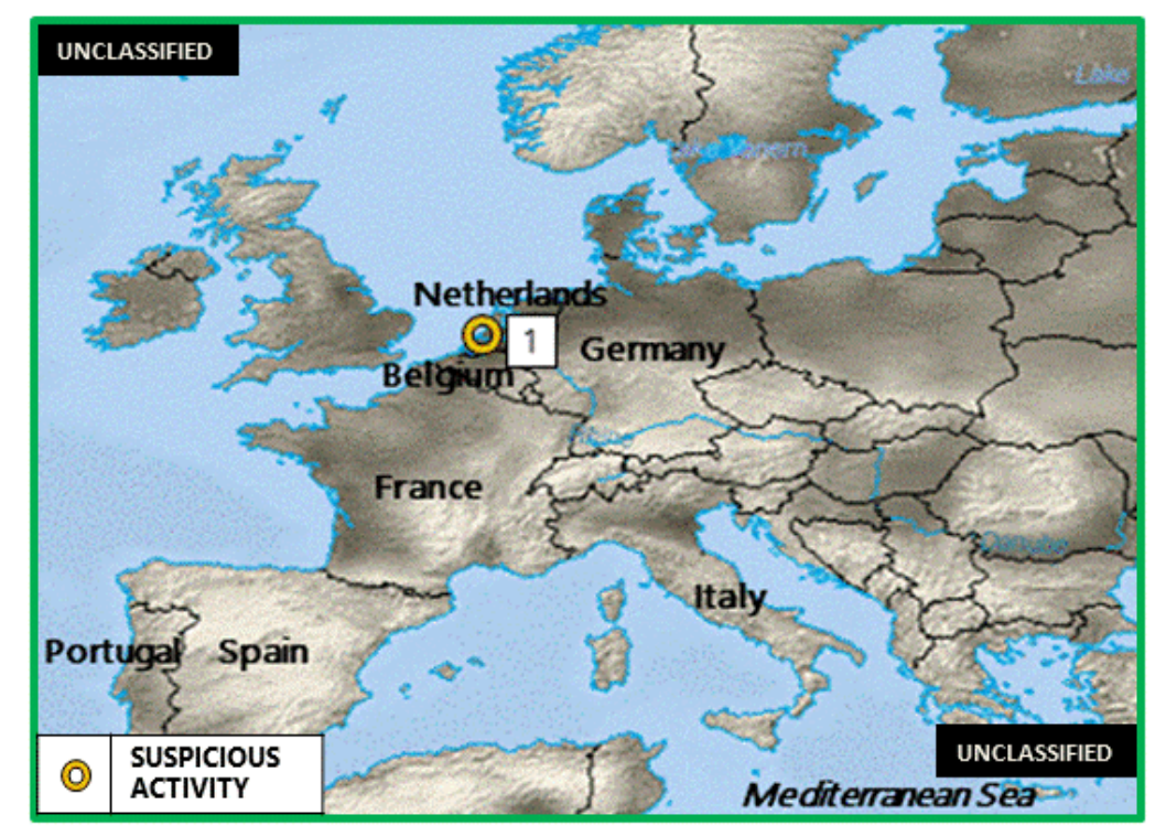
Figure 2. Northern Europe - Baltic Piracy and Maritime Crime

1. (U) THE NETHERLANDS: On 16 January, customs officers in Rotterdam discovered two separate shipments of cocaine, totaling approximately 1,069 kilograms. The first shipment of 839 kilograms was found in a shipping container from Brazil with two old Volkswagen vans. The second shipment of 230 kilograms of cocaine was found in a shipping in a shipping container full of beer. (www.nltimes.nl)