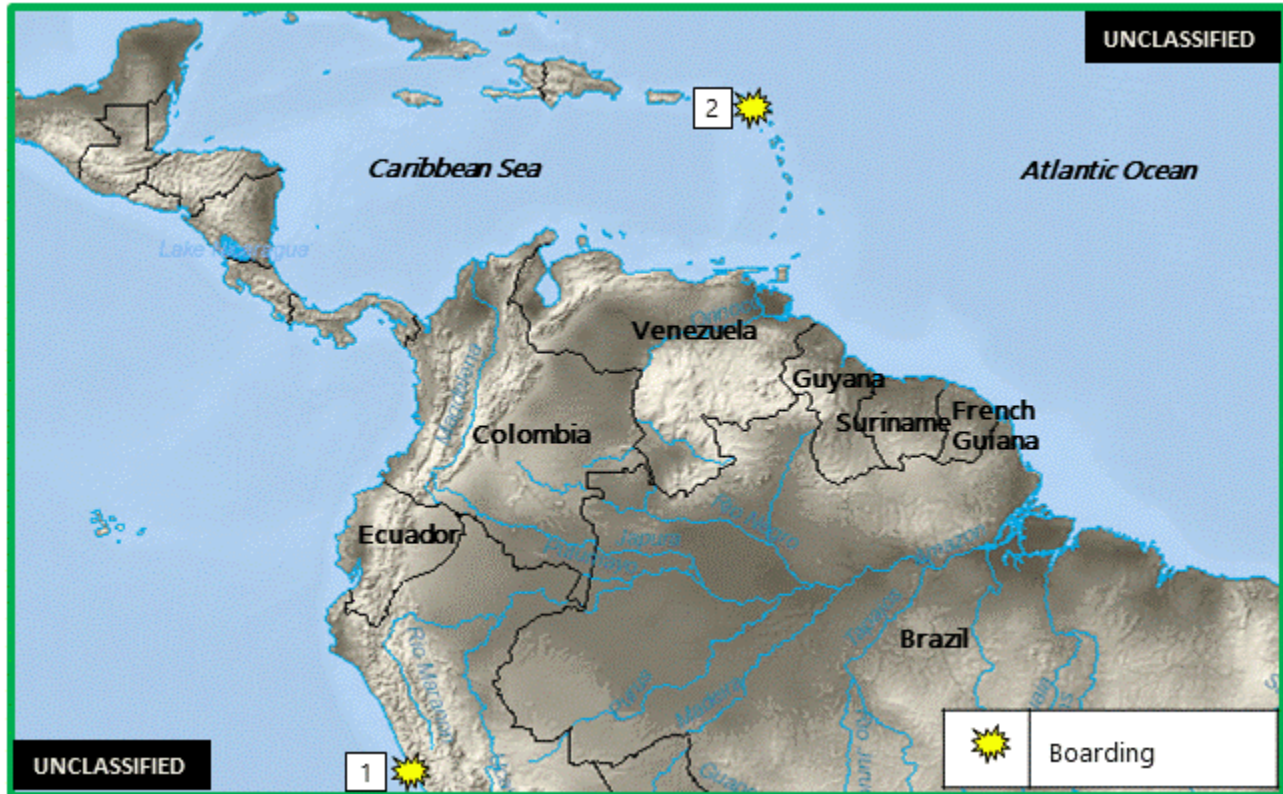
Figure 1. Central America – Caribbean – South America Piracy and Maritime Crime

B. (U) CENTRAL AMERICA – CARIBBEAN – SOUTH AMERICA: