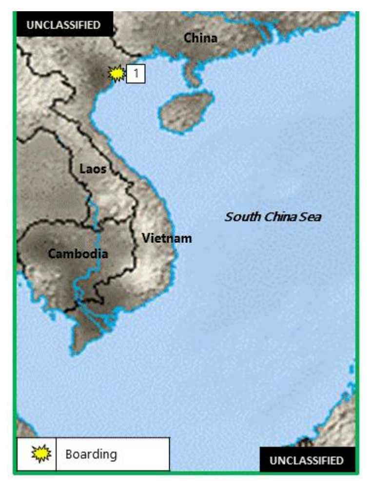
Figure 4. East Asia – Southeast Asia Piracy and Maritime Crime

1. (U) VIETNAM: On 15 March, robbers boarded a moored bulk carrier at Campha Port, near position 20:54N – 107:16E. The robbers broke into two crew cabins, stealing cash before making their escape. The local authorities were informed and an investigation was carried out. (IMB; Clearwater Dynamics)