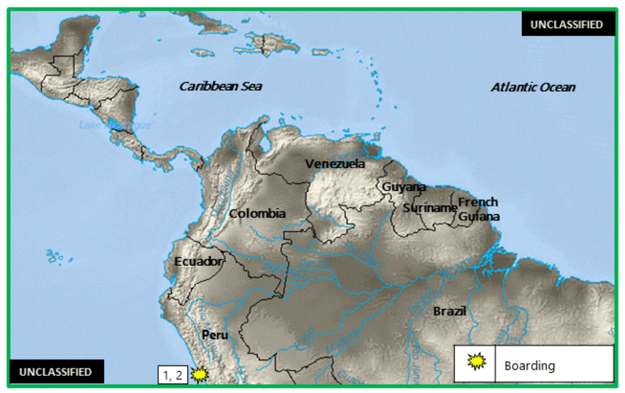
Figure 1. Central America – Caribbean – South America Piracy and Maritime Crime

(U) PERU: On 16 March, robbers boarded an anchored bulk carrier at Callao Anchorage, near position 12:01S – 077:10W. The robbers managed to board the vessel, break into the forecastle store room and steal ship's properties without being spotted. The duty crew noticed the robbery had taken place while on routine rounds. (IMB; Clearwater Dynamics)