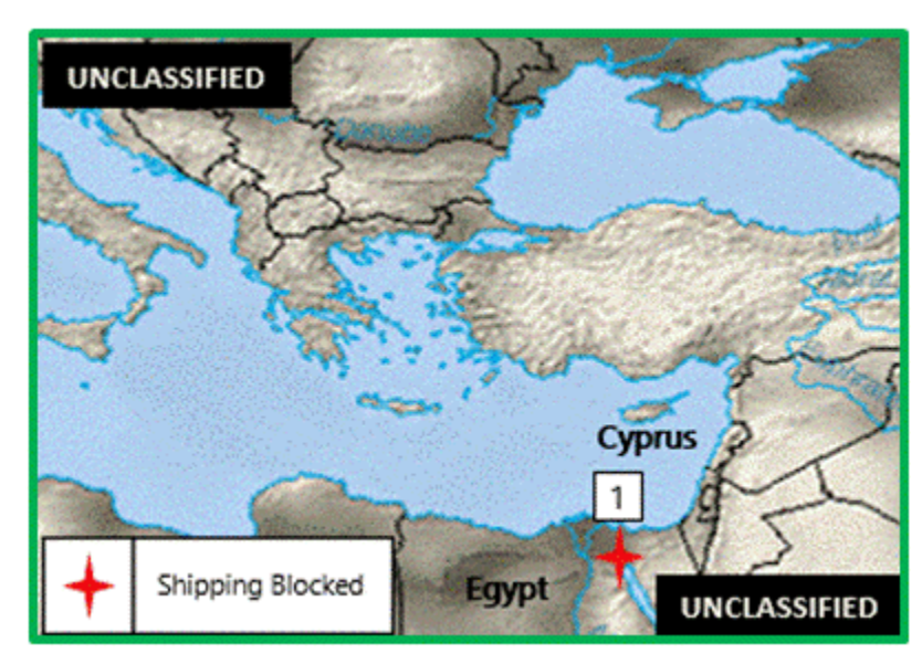
Figure 3. Indian Ocean – East Africa – Red Sea Piracy and Maritime Crime