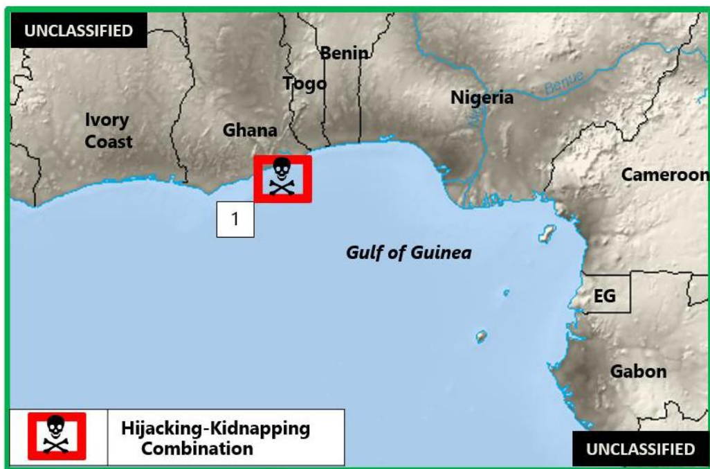
Figure 1. West Africa Piracy and maritime Crime

1. (U) GHANA: On 19 May, eight armed perpetrators in a skiff initially approached and fired upon a Ghana-flagged fishing trawler at 18:30 local time in position 04:33N – 000:15E, approximately 66 NM south of Tema. The trawler stopped, and five armed pirates boarded and remained onboard for about six hours. The pirates kidnapped five crew members (four Chinese nationals and one Russian), and removed personal crew belongings and other valuables. No injuries were reported to the remaining crew. The trawler's crew identified the pirates as Nigerian. After the kidnapping, the trawler headed back towards Tema port. (Clearwater Dynamics)