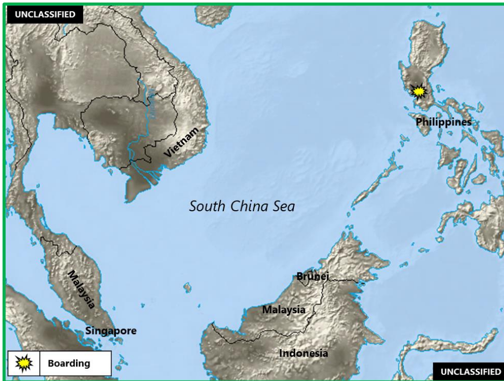
Figure 2. East Asia – Southeast Asia Piracy and Maritime Crime

1. (U) PHILIPPINES: On 16 June, at 00:30 local time, five robbers boarded the anchored Singapore-flagged container ship SIMA SAHBA at the Manila Anchorage near position 14:34N – 120:55E and escaped with stolen cans of paint from the ship's store. The duty officer spotted the robbers during their escape on a waiting motorized boat. The incident was reported to the Philippine Coast Guard. (Clearwater Dynamics; ReCAAP; IMB)