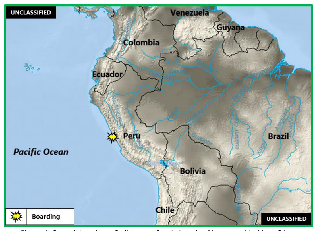
Figure 1. Central America – Caribbean – South America Piracy and Maritime Crime

1. (U) PERU: On 2 July, at 21:12 local time, six robbers were spotted by the duty crew climbing through the starboard side anchor chain to board the Singapore-flagged bulk carrier SANTA BARBARA while anchored at Callao Inner Anchorage, near position 12:00S – 077:13W. The alarm was raised and the crew mustered. The robbers escaped empty-handed. The incident was reported to the coastal state authorities, who subsequently informed the naval vessel on patrol. (Clearwater Dynamics; IMB; IMO-GISIS)