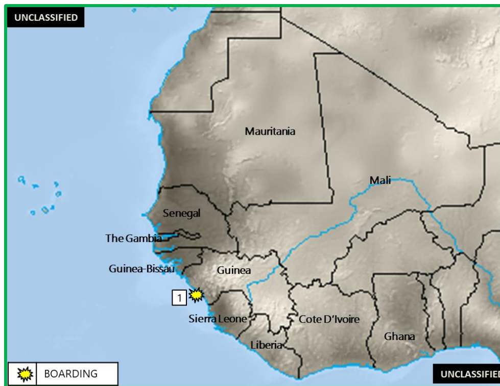
Figure 2. West Africa Piracy and Maritime Crime

1. (U) GUINEA: On 8 July, at 04:30 local time, seven robbers armed with firearms and knives boarded the Bahamas-flagged bulk carrier MACHITIS anchored at Conakry Anchorage near position 09:18N – 013:49W. The robbers managed to steal crew belongings before escaping. Port control was notified and all crew were reported safe. (Clearwater Dynamics; IMB; IMO-GISIS)