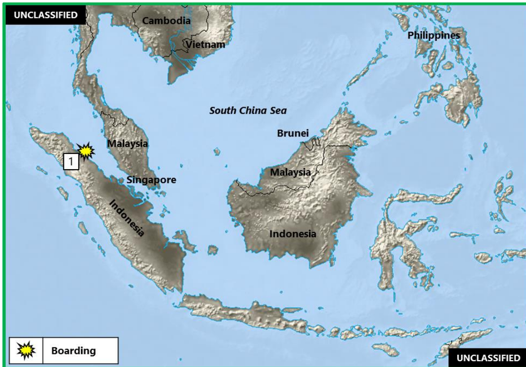
Figure 3. East Asia – Southeast Asia Piracy and Maritime Crime

1. (U) INDONESIA: On 8 July, at 02:18 local time, two robbers armed with a knife and a rod boarded the Singapore-flagged chemical tanker OCEAN MORAY anchored at Belawan Anchorage near position 03:55N – 098:44E. It was suspected that the robbers boarded through the hawse pipe by climbing the anchor chain. The alarm was raised and the robbers escaped through fire hoses secured to a bollard. Two fire hose couplings were reported stolen. The incident was reported to the port authorities. (Clearwater Dynamics; IMB; ReCAAP; IMO-GISIS)