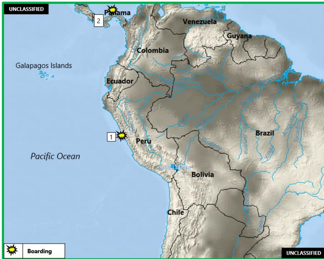
Figure 1. Central America – Caribbean – South America Piracy and Maritime Crime

1. (U) PERU: On 12 July, at 19:20 local time, five robbers boarded a product tanker using ropes while anchored at Callao Anchorage near position 12:01S – 077:13W. The duty crew noticed the robbers and raised the alarm. Following their detection, the robbers escaped in a motor boat. The crew were mustered and search was carried out. The bosun's store padlock was cut, but no items were reported stolen. The incident was reported to Callao port control and the patrol boat in the vicinity was notified. (Clearwater Dynamics; IMO-GISIS)