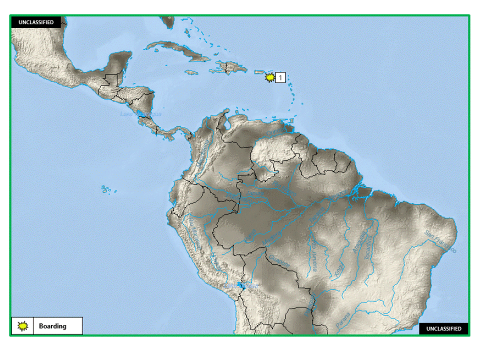
Figure 1. Central America – Caribbean – South America Piracy and Maritime Crime

1. (U) U.S. VIRGIN ISLANDS: On 18 July, robbers stole a dinghy and outboard motor from a sailing yacht anchored in Salt Pond Bay. (www.safetyandsecuritynet.org)