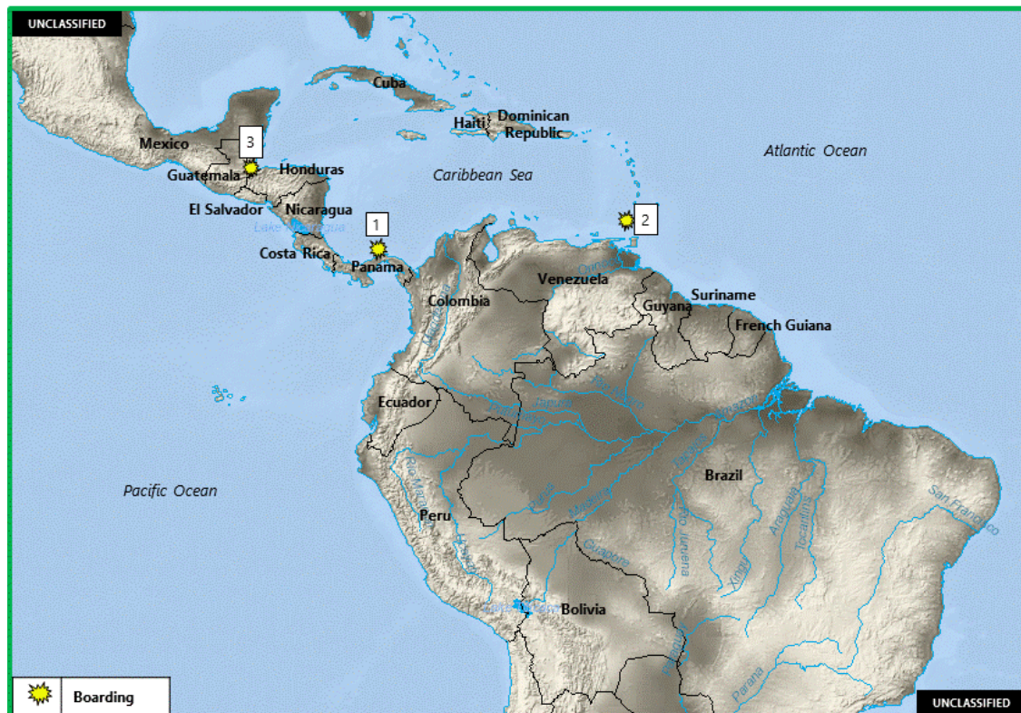
Figure 1. Central America – Caribbean – South America Piracy and Maritime Crime

B. (U) CENTRAL AMERICA – CARIBBEAN – SOUTH AMERICA: