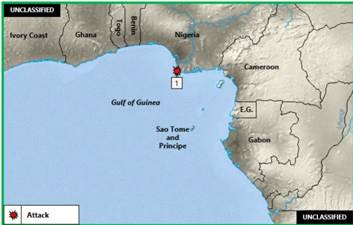
Figure 2. West Africa Piracy and Maritime Crime

1. (U) NIGERIA: On 16 August at 0600 local time, robbers attacked an oil platform approximately 10 NM southwest of Bayelsa State coast, near position 04:15N – 005:45E. The armed men approached the platform in one speedboat and an exchange of gunfire took place with the military personnel onboard the platform. Upon seeing a nearby security vessel, the speedboat fled the area. (Clearwater Dynamics)