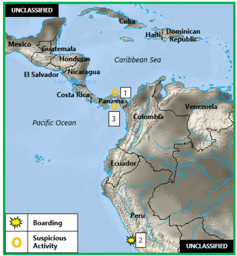
Figure 1. Central America – Caribbean – South America Piracy and Maritime Crime

1. (U) PANAMA: On 12 November, a yacht anchored at Isla Naranjo Bajo, about 10 NM east of Colon, was approached late in the evening by three men in a local panga who threatened the yacht's crew. The panga came alongside, and it was apparent two of the three men were under the influence of alcohol or drugs. They asked to have a phone but could not say for what purpose, so the request was denied. Later one of the men showed a phone that they used to translate some of their demands. They were not subtle about looking at the yacht's outboard which was secured to the arch and they began looking into the hatches, while requesting beer and cigarettes. The men became increasingly impatient and rude, asking for a credit card to pay for "piracy protection." The crew was ultimately able to satisfy the men with a $20 cash payment, and the panga departed westward toward Colon. The yacht pulled up anchor and departed eastward to Linton Bay. (www.noonsite.com)