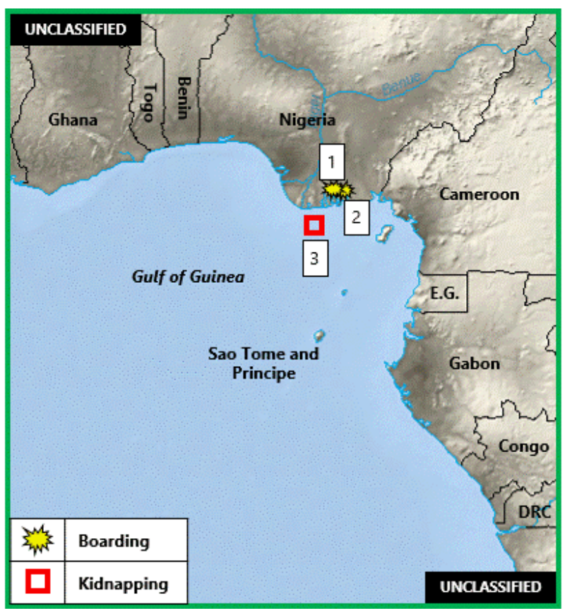
Figure 2. West Africa Piracy and Maritime Crime

1. (U) NIGERIA: On 15 November, gunmen attacked fishermen in the Ibeno local government area of Akwa Ibom State and carted away eight outboard engines. This latest attack came less than 48 hours after sea pirates attacked fishermen in Itanwa area of Ikot Abasi LGA and stole eight Yamaha outboard engines. (www.dailypost.ng)