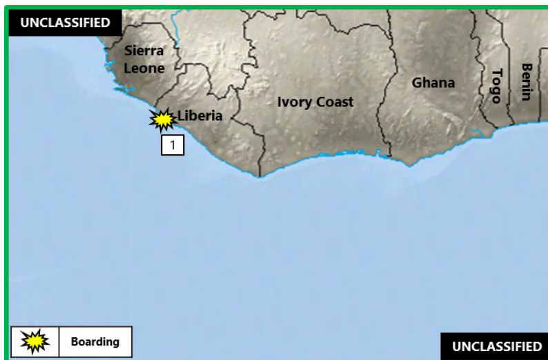
Figure 2. West Africa Piracy and Maritime Crime