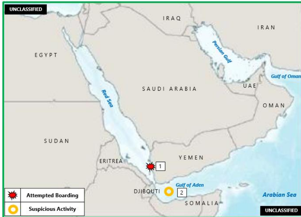
Figure 1. Indian Ocean – East Africa – Red Sea Piracy and Maritime Crime

H. (U) INDIAN OCEAN – EAST AFRICA – RED SEA: