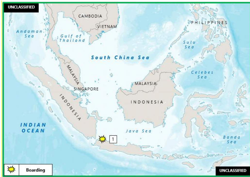
Figure 2. East Asia – Southeast Asia Piracy and Maritime Crime

1. (U) INDONESIA: On 17 May, at 2215 local time, an unknown number of robbers boarded a container vessel anchored in Jakarta Anchorage, near position 06:01S – 106:55E. The duty officer sighted an unlit small boat at the ship's astern, and at the same time, the steering room door alarm went off. The general alarm was raised, the crew mustered, and the vessel was searched. According to reports, the perpetrators escaped empty-handed. The incident was reported to the local authorities. (IMB; Clearwater Dynamics)