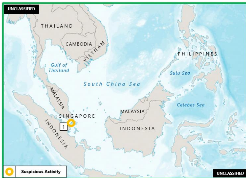
Figure 2. East Asia – Southeast Asia Piracy and Maritime Crime

1. (U) INDONESIA: On 30 May, the Panama-flagged tanker NORD JOY, was detained by the Indonesian Navy off Batam Island on suspicion of anchoring in Indonesian waters without a permit. According to press reports, the Indonesian Navy personnel boarded the vessel while anchored in Indonesian waters, east of the Singapore Strait. The vessel was then escorted by the Indonesian Navy to an anchorage near Batam for further investigation. (vesseltracker.com; Reuters; Jakarta Post; Asia Financial)