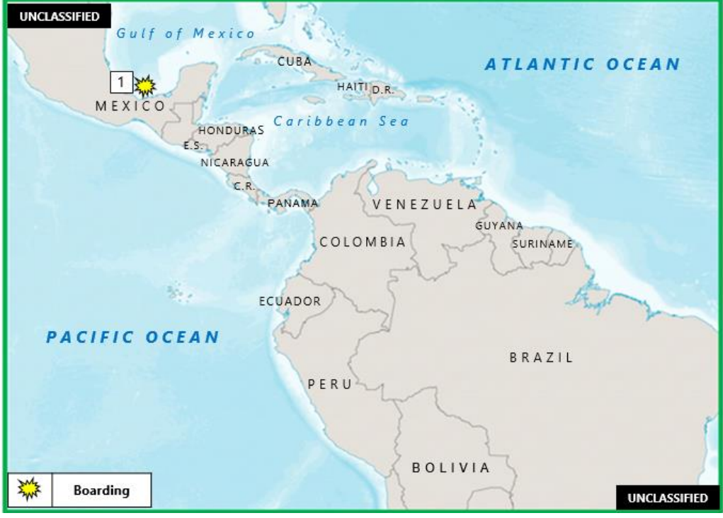
Figure 1. North America Piracy and Maritime Crime

1. (U) MEXICO: On 14 June, at 1900 local time, 10 armed robbers boarded a Petroleos Mexicanos platform at the Rebombeo pumping complex in the Bay of Campeche. According to press reports, the robbers were dressed in military-style attire and arrived at the offshore pumping complex in three boats. The perpetrators stayed onboard for about three hours, stealing sets of tools, self-contained breathing apparatuses, and other valuable equipment. Reports indicate that while crewmembers were forced to carry stolen items to the perpetrators' boats, no crewmembers were injured during the incident. (Mexico News Daily, Maritime Executive; Dryad Global; Splash 24/7)