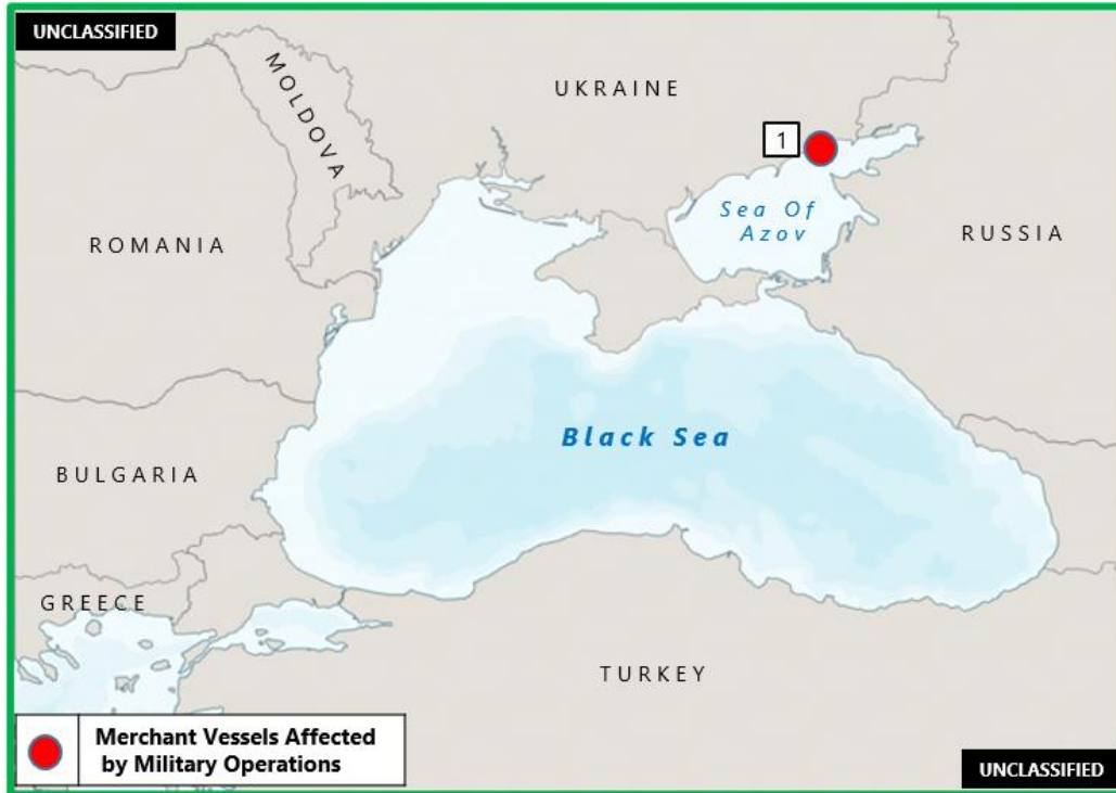
Figure 1. Mediterranean – Black Sea Piracy and Maritime Crime

1. (U) UKRAINE: Prior to 5 July, two bulk carriers, Liberia-flagged SMARTA and Panama-flagged BLUE STAR I, that had already berthed at the port of Mariupol, were seized by the Russian-backed separatist group, Donetsk Peoples Republic (DPR). According to press reports, DPR representatives sent letters to the two shipping companies stating that their ships were subjected to "forcible appropriation of movable property with forced conversion into state property," offering no compensation. The two ships have been stranded at the port since 24 February 2022 and their crews were reportedly evacuated on or before 11 April 2022. (Clearwater Dynamics; gCaptain; Reuters; Newsweek; Maritime Executive)