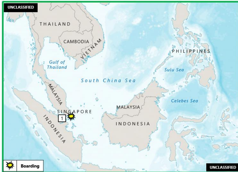
Figure 3. East Asia – Southeast Asia Piracy and Maritime Crime

1. (U) INDONESIA: On 4 July, at 0410 local time, six robbers armed with guns boarded the Panama-flagged bulk carrier NEMRUT BAY underway in the eastbound lane of the Singapore Strait Traffic Separation Scheme (TSS), near position 01:17N – 104:19E. The robbers were sighted in the engine room, and restrained one of the duty crew members. After the robbers escaped, the restrained crew member managed to free himself and immediately raised the alarm. The crew mustered, and the vessel was searched. The master later reported that the six robbers had stolen engine spare parts, and all crew were safe. The vessel did not require any assistance and continued its voyage. The incident was reported to the local authorities. (vesseltracker.com; ReCAAP; IMB; Clearwater Dynamics)