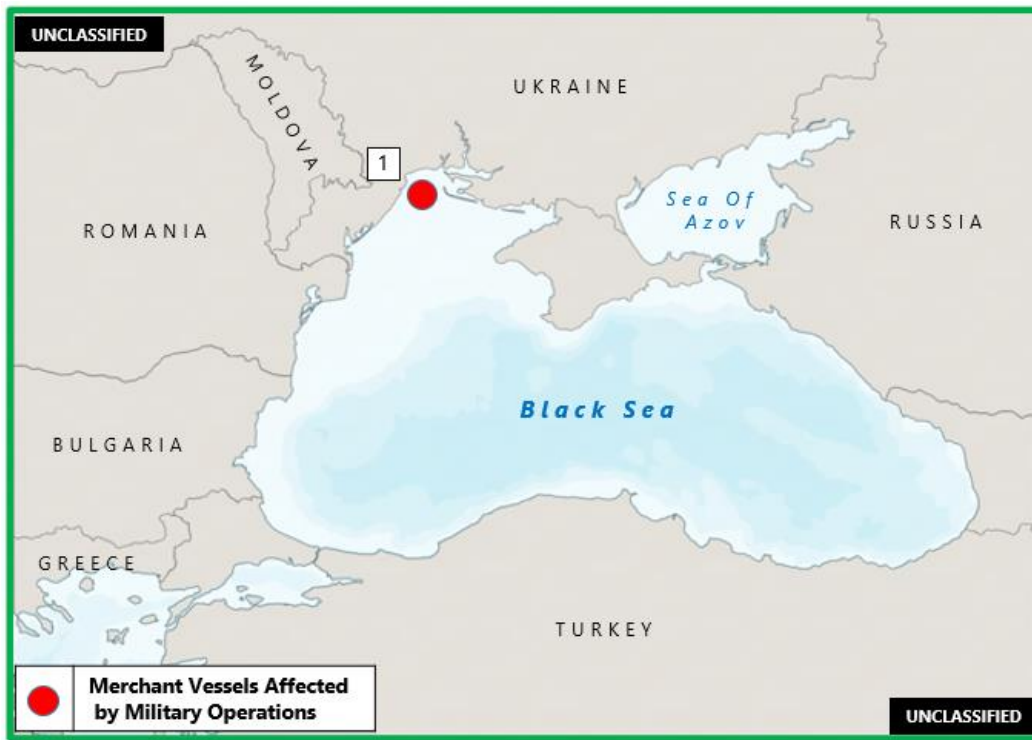
Figure 2. Mediterranean – Black Sea Piracy and Maritime Crime

1. (U) UKRAINE: On 7 July, the Moldova-flagged tanker MILLENNIAL SPIRIT was struck by a missile while unmanned and adrift in the Odessa region of the Black Sea. This is the second time that the tanker was hit. According to press reports, the tanker had been abandoned and drifting since 25 February when it was first hit. (Clearwater Dynamics; Splash 24/7; Fleetmon; Dryad Global)