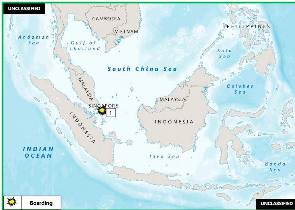
Figure 3. East Asia – Southeast Asia Piracy and Maritime Crime

1. (U) MALAYSIA: On 8 July, at 2324 local time, five perpetrators armed with knives boarded a tanker underway in the eastbound lane of the Singapore Strait Traffic Separation Scheme (TSS), near position 01:17N – 104:19E. The perpetrators went to the engine room and restrained the duty engineer. They were sighted by the duty crew during rounds, and alerted the bridge. The alarm was raised, and the crew mustered. The robbers escaped empty-handed upon hearing the alarm. The ship and all crew were reported safe. The vessel did not require assistance and continued her voyage. (IMB; Clearwater Dynamics)