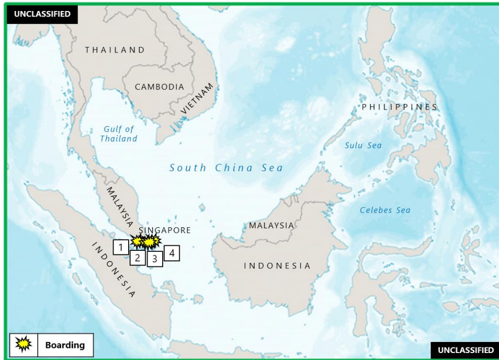
Figure 1. East Asia – Southeast Asia Piracy and Maritime Crime