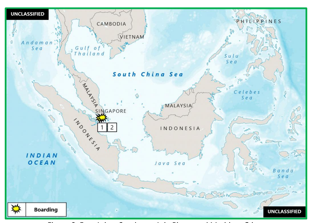
Figure 2. East Asia – Southeast Asia Piracy and Maritime Crime