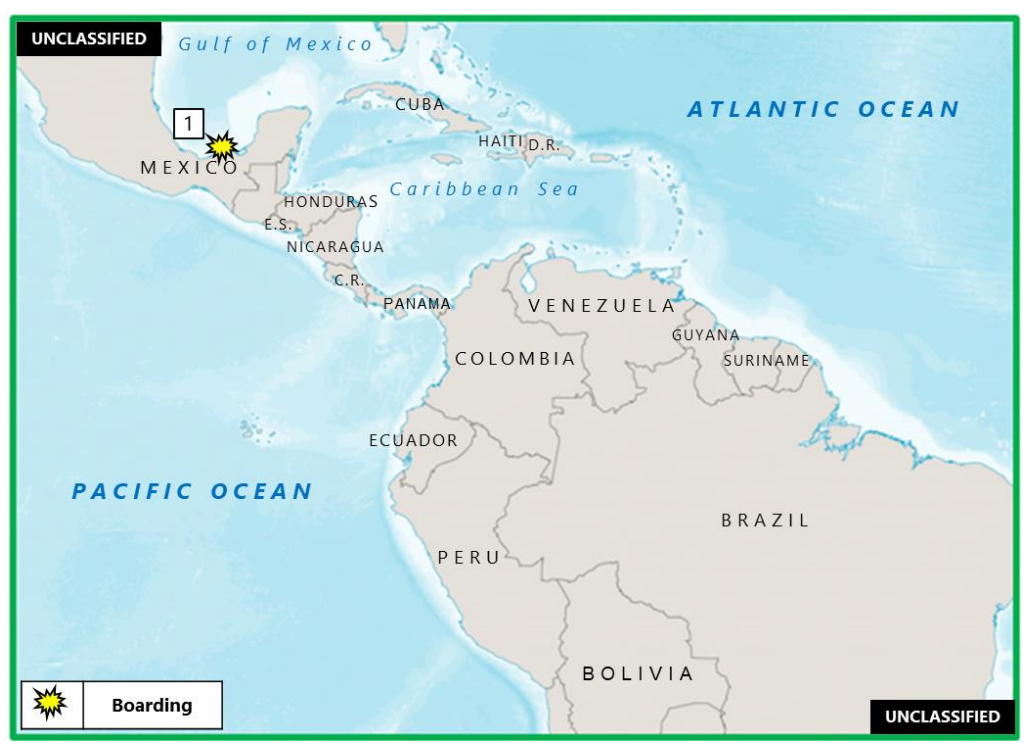
Figure 1. North America Piracy and Maritime Crime