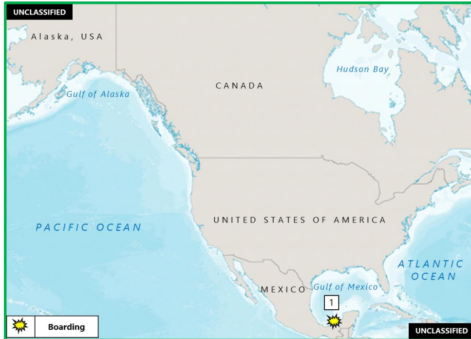
(U) Figure 1. North America Piracy and Armed Robbery at Sea

1. (U) MEXICO: On 7 September at 1930 local time, robbers boarded an oil platform in the southern Gulf of Mexico's Bay of Campeche, approximately 14 NM northwest of Campeche port, near position 19:58N – 090:44W. After maintenance personnel had departed the platform, the marine control center for the oil company was made aware of robbers, on two small boats, gaining access onto the platform and stealing equipment. Mexico's Marine Secretariat (Secretary of the Navy) was alerted and a security vessel was dispatched to the location. The security vessel interdicted and detained a boat with six persons onboard, however, there was no evidence that the boat or persons onboard had been involved in the robbery. The security vessel then released the boat and six persons. (Clearwater Dynamics)