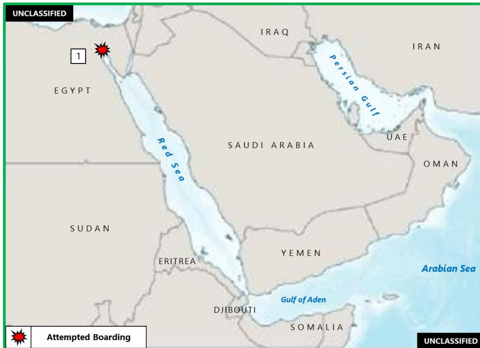
(U) Figure 3. Indian Ocean – East Africa – Red Sea Piracy and Armed Robbery at Sea

H. (U) INDIAN OCEAN – EAST AFRICA – RED SEA: