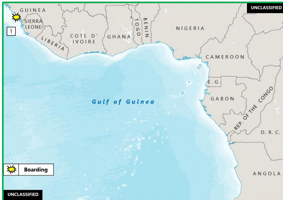
(U) Figure 2. West Africa – Gulf of Guinea Piracy and Armed Robbery at Sea

1. (U) GUINEA: On 14 September at 0005 UTC, five robbers armed with knives and guns boarded the anchored Antigua and Barbuda-flagged general cargo ship MARTINA at Conakry Anchorage, near position 09:12N – 013:46W. The perpetrators attempted to force their way into interior spaces which resulted in the crew retreating to the citadel. Port control was informed and a security vessel was dispatched. As the security vessel approached the cargo ship, the robbers were observed escaping on a motor-powered boat with stolen items of ship's equipment. The ship reported damage to external doors and navigation equipment. The vessel and crew are safe. (MDAT-GoG; splash247.com; Clearwater Dynamics)