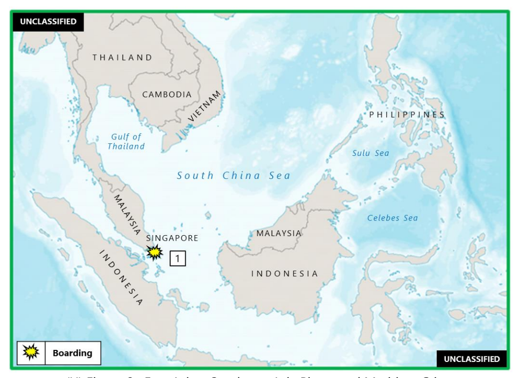
(U) Figure 2. East Asia – Southeast Asia Piracy and Maritime Crime

1. (U) MALAYSIA: On 17 September at 1650 local time, as many as ten robbers from four sampans boarded a transiting barge towed by a Singapore-flagged tugboat in the westbound lane of the Singapore Strait Traffic Separation Scheme, in position 01:17N – 104:09E. The crew noticed persons stealing cargo and raised the alarm. Vessel Traffic Information System was informed, and a patrol boat was sent to investigate. Upon seeing the patrol boat, the perpetrators escaped with stolen scrap metal. The master informed the port operations control center that the crew were safe and no assistance was required. The tugboat continued its voyage to Vietnam. (IMB; Clearwater Dynamics)