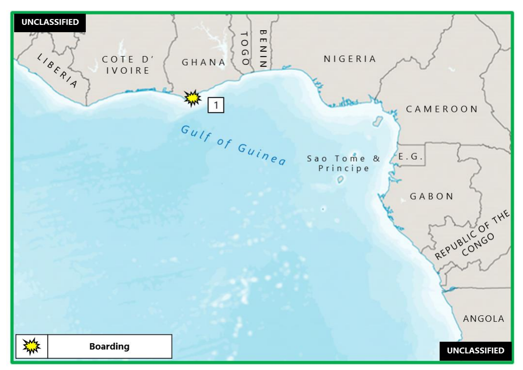
(U) Figure 1. West Africa – Gulf of Guinea Piracy and Armed Robbery at Sea