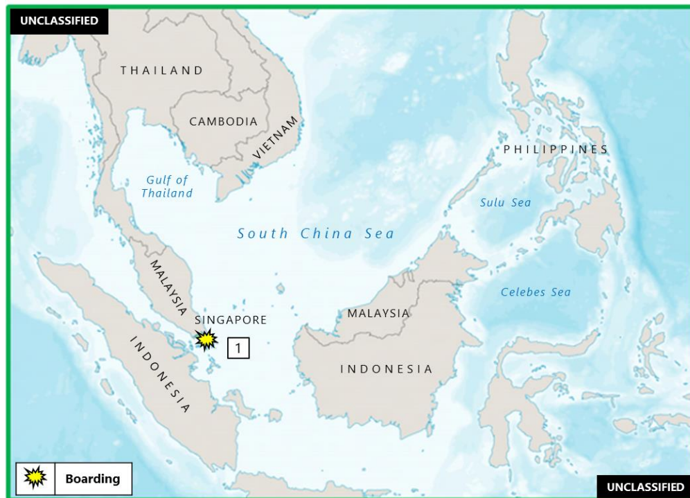
(U) Figure 2. East Asia – Southeast Asia Piracy and Maritime Crime

1. (U) MALAYSIA: On 17 September at 1650 local time, as many as ten robbers from four sampans boarded a transiting barge towed by a Singapore-flagged tugboat in the westbound lane of the Singapore Strait Traffic Separation Scheme, in position 01:17N – 104:09E. The crew noticed persons stealing cargo and raised the alarm. Vessel Traffic Information System was informed, and a patrol boat was sent to investigate. Upon seeing the patrol boat, the perpetrators escaped with stolen scrap metal. The master informed the port operations control center that the crew were safe and no assistance was required. The tugboat continued its voyage to Vietnam. (IMB; Clearwater Dynamics)