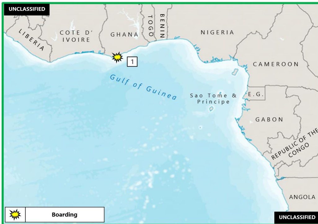
(U) Figure 1. West Africa – Gulf of Guinea Piracy and Armed Robbery at Sea

1. (U) GHANA: On 19 September between 1250 and 0250 local time, crewmembers discovered as many as four unauthorized persons onboard the anchored Liberia-flagged refrigerated cargo ship ACONCAGUA BAY at Takoradi Anchorage, in position 04:54N – 001:41W. They raised the alarm, and called Takoradi Port Security. The crew determined that the perpetrators had stolen ship's stores before their escape. All crew were reported safe. (MDAT-GoG; Clearwater Dynamics; vesseltracker.com)