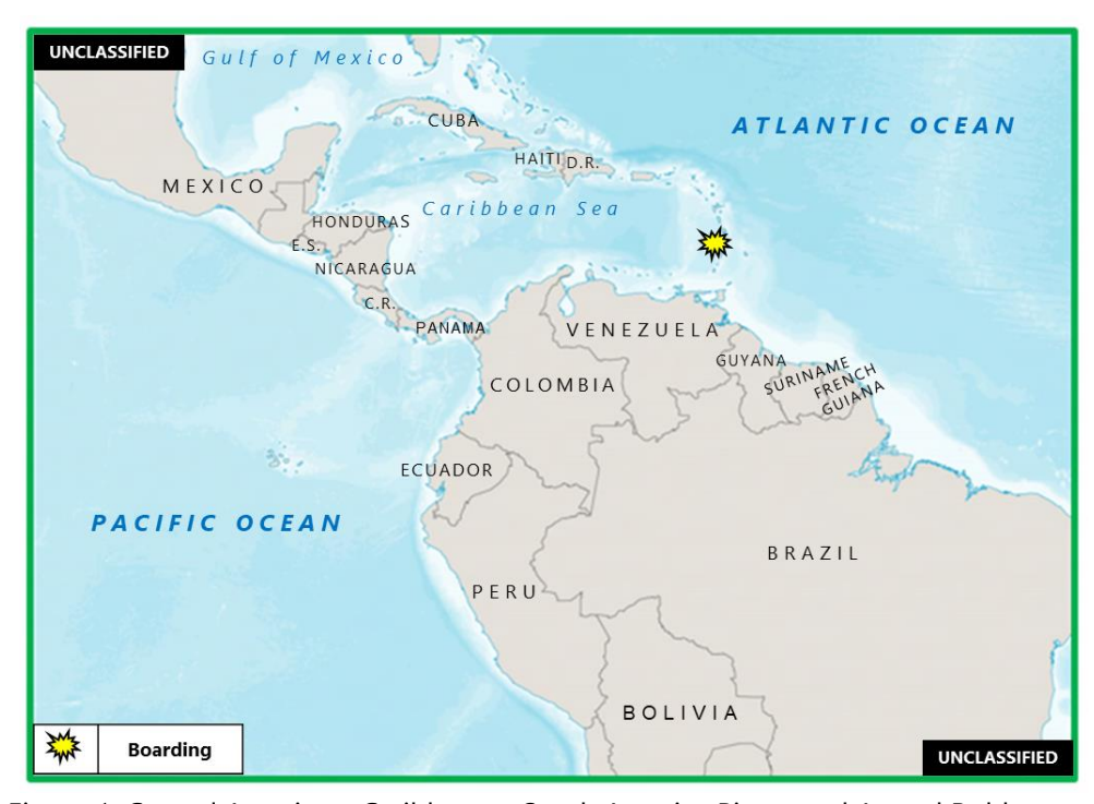
(U) Figure 1. Central America – Caribbean – South America Piracy and Armed Robbery at Sea