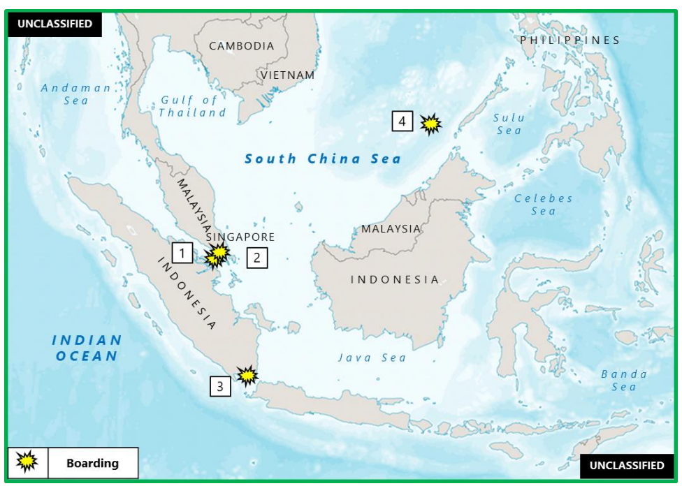
U) Figure 1. East Asia – Southeast Asia Piracy and Armed Robbery at Sea

1. (U) INDONESIA: On 17 October at 0105 local time, three unauthorized persons boarded underway Malta-flagged bulk carrier MINOAN GRACE in the Phillip Channel, Singapore Strait near position 01:09N – 103:26E. Duty crew members spotted the robbers in the engine room and raised the alarm. After a search of the vessel, no perpetrators were located. The master declared nothing had been stolen and all crew were safe. The master reported the incident to Singapore Vessel Traffic Information System, notified the Republic of Singapore Navy and Singapore Police Coast Guard, and shared incident information with Indonesian authorities. (ReCAAP; Clearwater Dynamics)