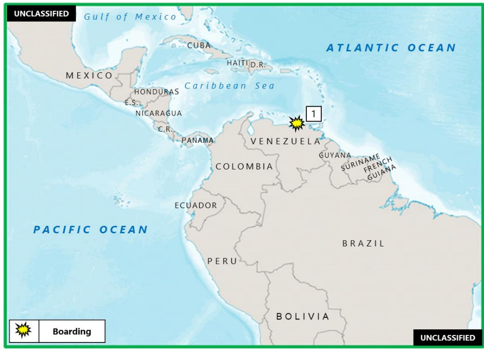
(U) Figure 1. Central America – Caribbean – South America Piracy and Armed Robbery at Sea