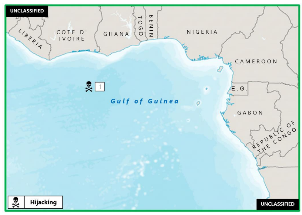
(U) Figure 2. West Africa – Gulf of Guinea Piracy and Armed Robbery at Sea