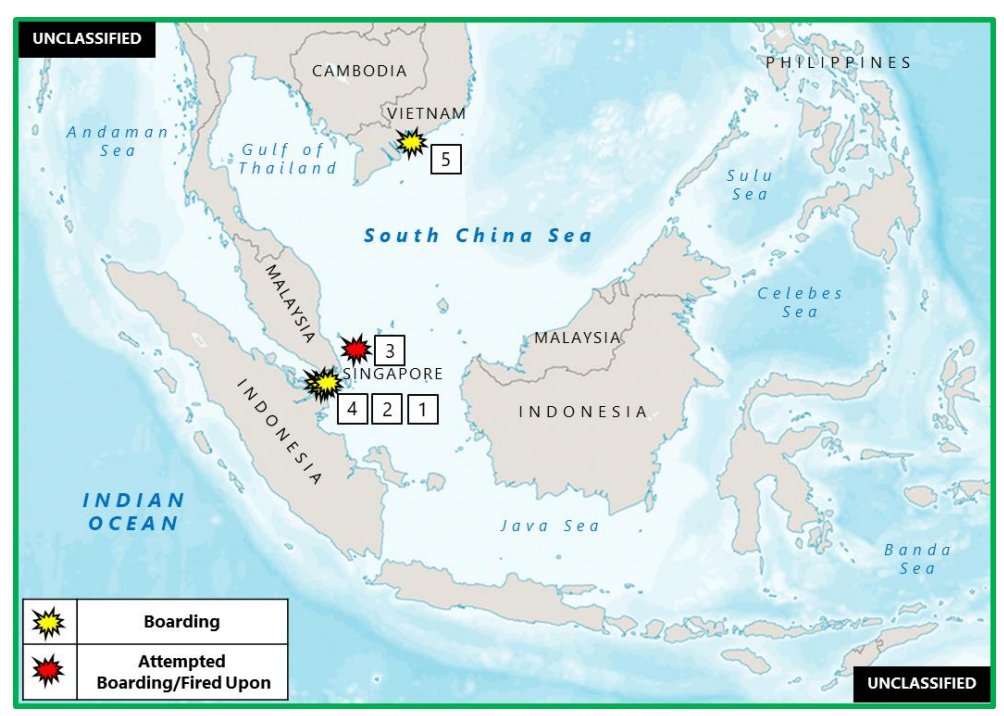
(U) Figure 3. East Asia – Southeast Asia Piracy and Armed Robbery at Sea