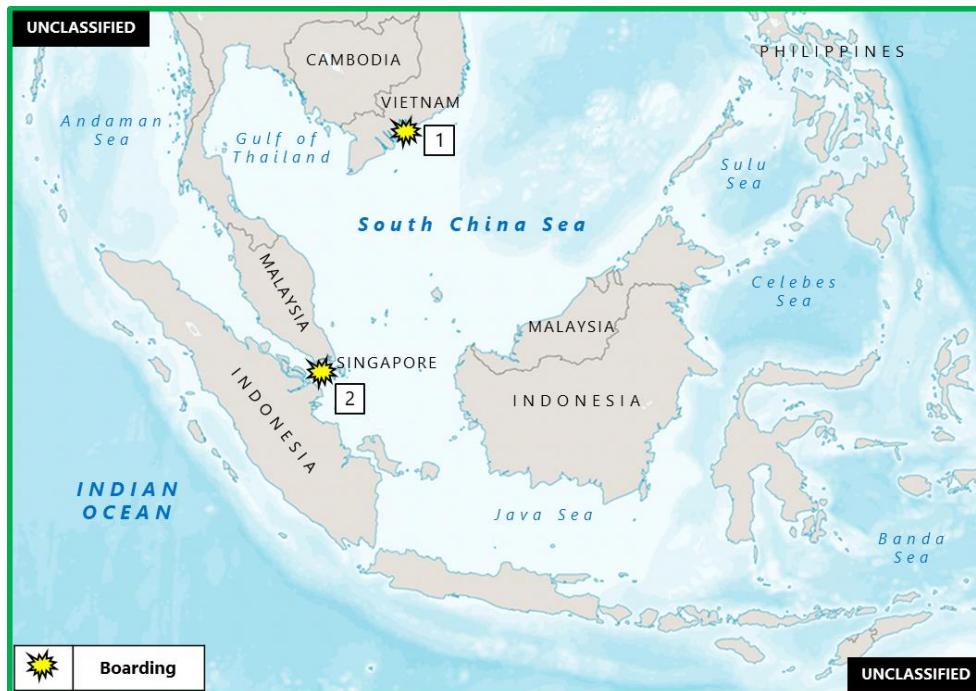
(U) Figure 1. East Asia – Southeast Asia Piracy and Armed Robbery at Sea

1. (U) VIETNAM: On 6 December, four robbers boarded a barge under tow by a Singapore-flagged tug in the Vung Tau Anchorage area, near position 10:10N – 107:02E. After two of the perpetrators were spotted, the master